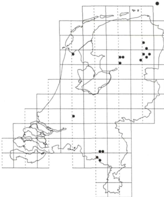
Fig. 2. Known distribution of Micarea subcinerea , based on grid squares of 5 x 5 km 2 . Large dot, the record from Germany.