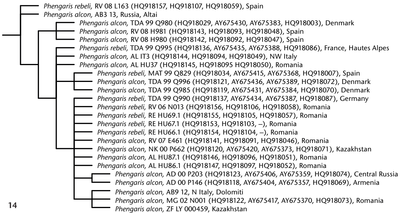
Fig. 14: Phylogenetic relationships of Phengaris alcon constructed from four genes (COI, COII, wingless, Ef-1 \alpha ). The sample codes represent voucher codes used in GenBank ( www.ncbi.nlm.nih.gov ) except for samples AB3 13, AB9 12 and ZF LY 000459, added for comparison.

Only after WWII the use of the generic name Maculinea for the species group consisting of Papilio alcon [SCHIFFERMÜLLER], 1775, Papilio arion LINNAEUS, 1758, Lycaena arionides STAUDINGER, 1887, Papilio nausithous BERGSTRÄSSER, 1779, and Papilio teleius BERGSTRÄSSER, 1779 has become dominant, probably following VERITY (1943).