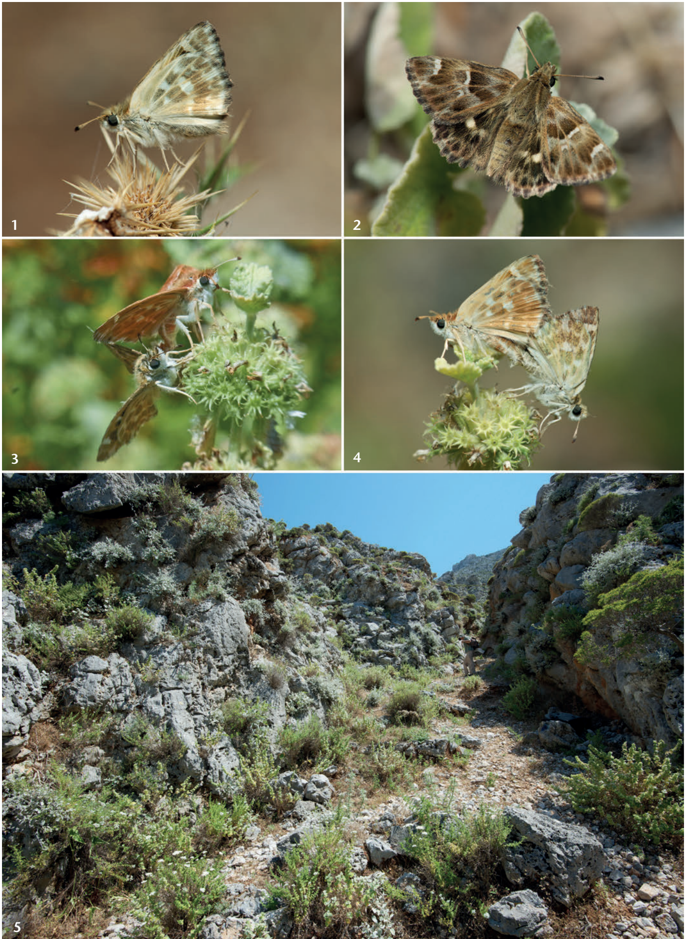
Figs. 1–10: Carcharodus stauderi . Fig. 1: Fresh ♂, Arginonda, 1. vi. 2012. Fig. 2: ♂, Arginonda, 1. vi. 2012. Fig. 3: Courtship behaviour, Arginonda, 2. vi. 2012. Fig. 4: Copulating pair on Marrubium vulgare , Arginonda, 2. vi. 2012. The coloration of the ♂ and ♀ are different, especially on the underside of the hindwings. Fig. 5: Habitat with hostplant Ballota acetabulosa , Arginonda, 1. vi. 2012.