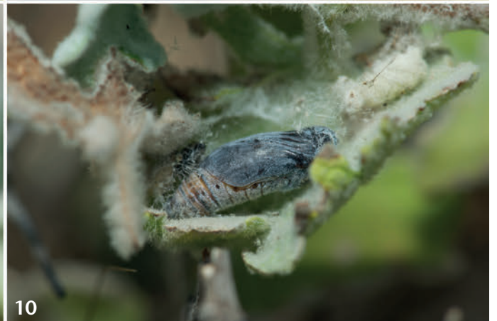
Fig. 6: Habitat with hostplant, Profitis Ilias, 4. vi. 2012. Fig. 7: Oviposition on Ballota acetabulosa , Arginonda, 1. vi. 2012. Fig. 8: Freshly laid egg on Ballota acetabulosa . The leaves were slightly manipulated to reveal the egg. Arginonda, 1. vi. 2012. Fig. 9: 4th instar larva (leaf shelter opened). As all other larvae found during the field trip, this one likewise turned out to be parasitised. Profitis Ilias, 4. vi. 2012. Fig. 10: Pupa in opened shelter, Profitis Ilias, 6. vi. 2012.