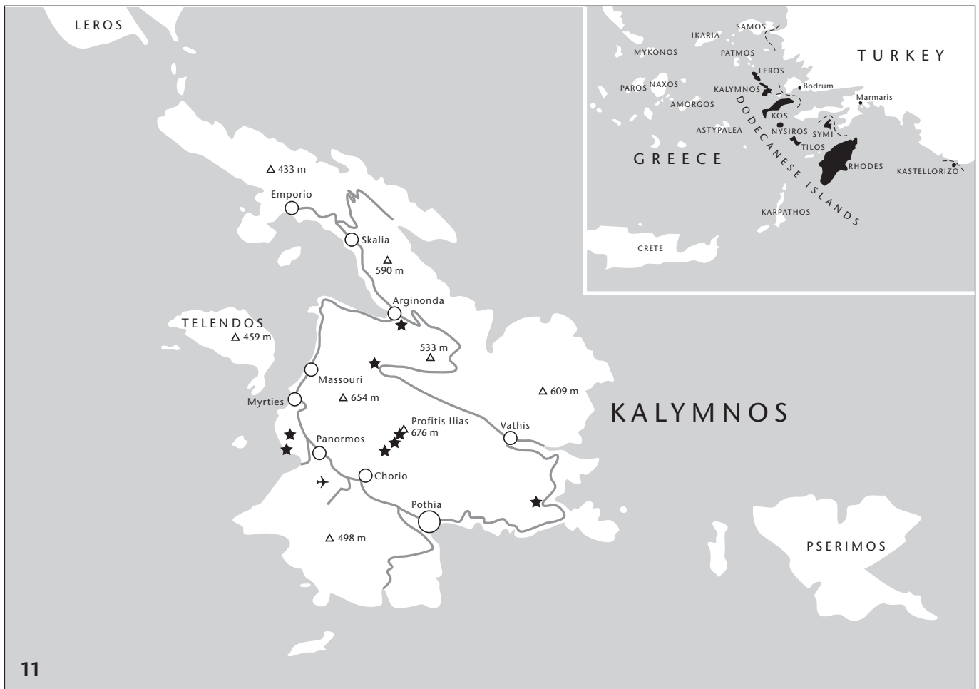
Fig. 11: Map of Kalymnos with localities of C. stauderi . — Inset: Map of the south-eastern Aegean Sea with islands inhabited by C. stauderi highlighted.

broods” (LARSEN 1974). However, detailed observations including the first instars are not available.