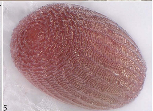
Figures 1–5. Agriopsis budashkini : Habitat and eggs.

1. Habitat in the eastern part of Levka Ori Mts., between Kallikratis and Asfendos, altitude, 800 m;