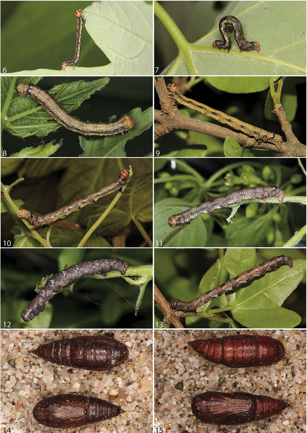
Figures 6–11. Larva Agriopsis budashkini : 6. second instar larva (L2), 7. third instar larva (L3), 8. fourth instar larva (L4), 9–11. fifth instar larva (L5); Figures 12–13. Larva (L5): 12. Agriopsis bajaria , 13. Agriopsis marginaria ; Figures 14–15. Pupa, Agriopsis budashkini : 14. pupa ♀, 15. pupa ♂. All specimens are from the second generation (F1) of the larvae collected from: Creta, eastern part of Levka Ori Mts., between Kallikratis and Asfendos, altitude: 800 m.