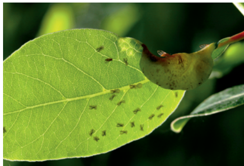
Fig. 4: Trioza alacris – gall on Laurus nobilis leaf caused by nymphs.