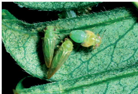
Fig. 2: Acizzia jamatonica - two adults and a nymph sucking on leaf of Albizia julbrissin .