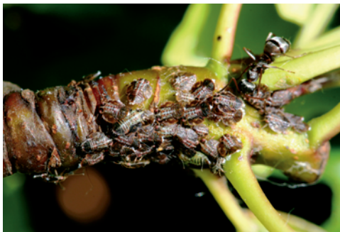
Fig. 3: Cacopsylla pyrisuga - nymphs visited by ants.