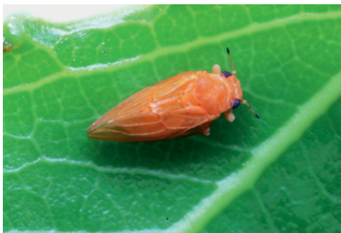
Fig. 1: Camarotoscena subrubescens – adult.

As long ago as 1888 Franz Löw made the most comprehensive overview of psyllids occurring in the territory of the former Austrian-Hungarian monarchy, which includes also the territory of the present Slovenia (Löw, 1888). This remains until now the only specialized work dealing with psyllids in the territory of Slovenia. In that work, 37 species belonging to the family Psyllidae and 14 species of Triozidae, collected within the Slovene territory are recorded. Most of the data Löw included were provided by Franz Then, who collected psyllids in the surroundings of Lesce (Less) and Bled (Valdes) and by Andor Hensch, who worked and collected in the surroundings of Gorica (Görz, Gorizia). The type material of at least three species originates from these two collecting areas. The type material