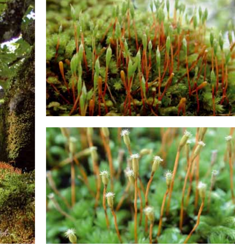
△ Tayloria rudolphiana grows in large cushions on old sycamore trees, often with masses of sporophytes which have conspicuously orange setae. Heike Hofmann