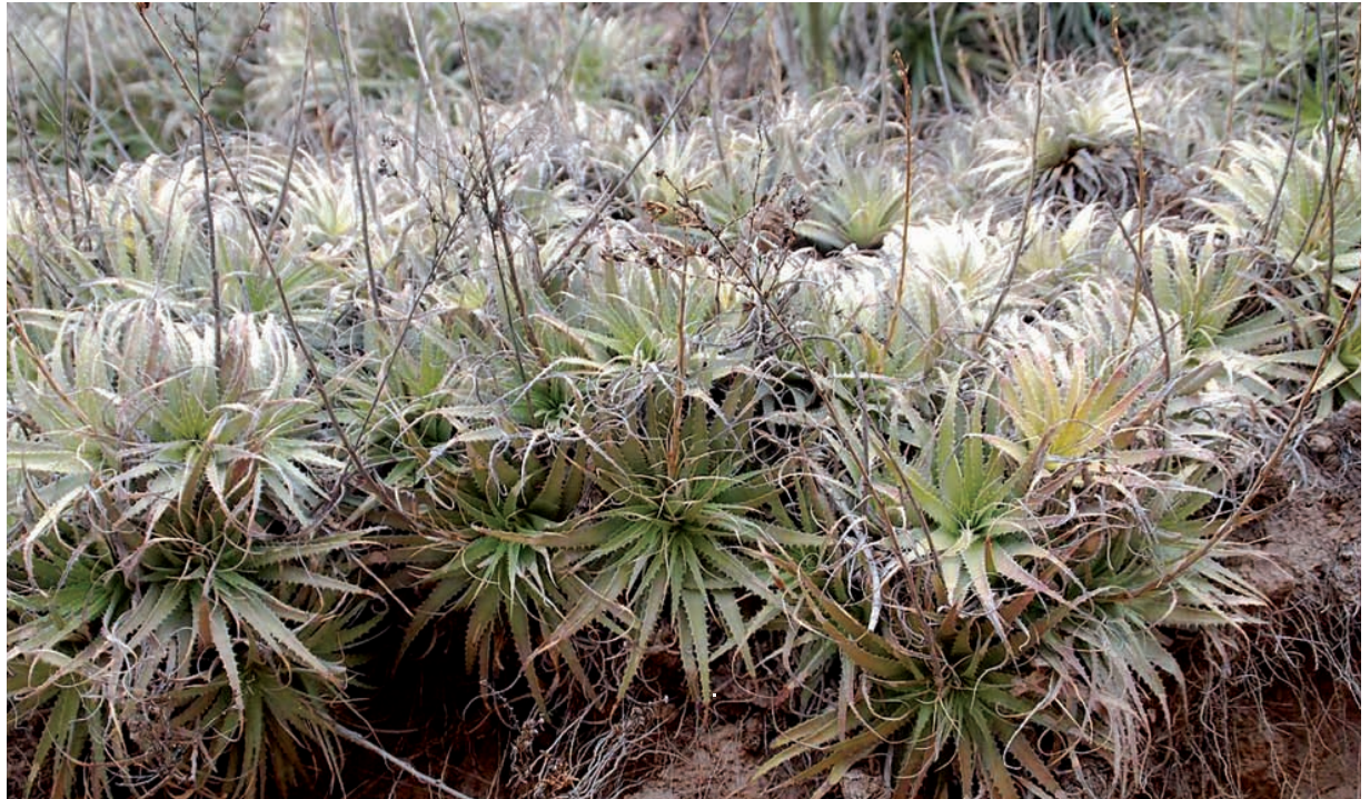
Fig. 23. A species of the bromeliad genus Puya showing the dead leaves that serve as a substrate for Perichaena calongei .

na (Fig. 23). It has proved to be an excellent substrate for myxomycetes as cultures of the leaf bases have been over 94% positive for myxomycete fruiting bodies or plasmodia. No other substrate, of the more than 100 moist chamber cultures, prepared with native plant remains from the same areas produced this species. It therefore appears to have microhabitat requirements found so far only in this plant genus.