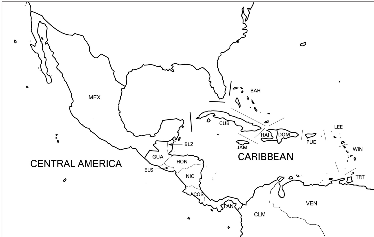
Fig. 1. Central America and the Caribbean.

Fuego. Tiny enclaves of one country in another have been ignored, and geographical disjunctions such as major or remote islands have been included in their countries of political dependence. According to these criteria, the Desventurados Islands and Juan Fernandez Islands are also included in Chile (CLI), the Galapagos Islands are included in Ecuador (ECU), and the Fernando de Noronha and Trindade Islands in Brazil (BZI).