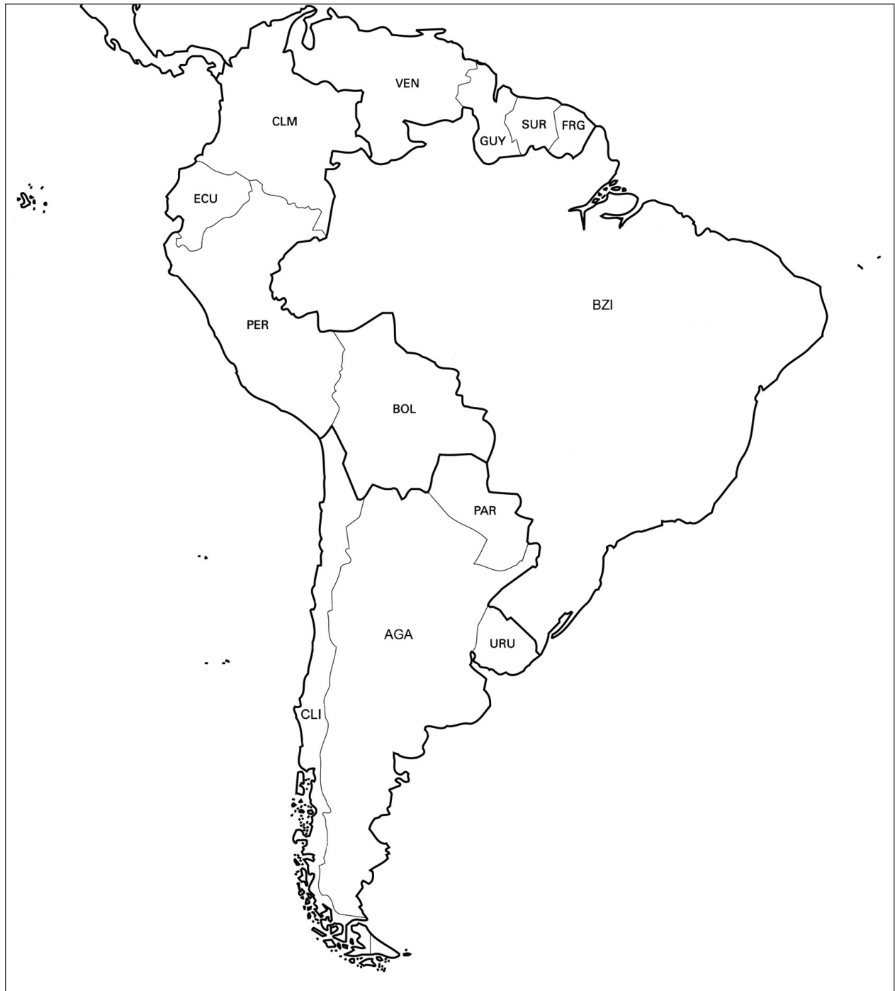
Fig. 2. South America.