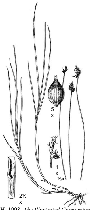
Holmgren, Noel H. 1998. The Illustrated Companion to Gleason and Cronquist's Manual . New York Botanical Garden.

Creeping Sedge is so unique that it is the only member of a sub-group of Carex called section Chordorrhizae . The leaves of this sedge are quite narrow (1-2 mm wide), and are shorter than the flowering stems. Leaves of the vegetative stems are longer than those of flowering stems. The spikes are few-flowered, with inconspicuous staminate flowers at the tip of each, and densely clustered, appearing like a single ovoid spike at the tip of the flowering shoot. The perigynia are plump, brown, and many-veined. Perigynia have a short beak that is one-fourth the length of the body. The achenes are lens-shaped.