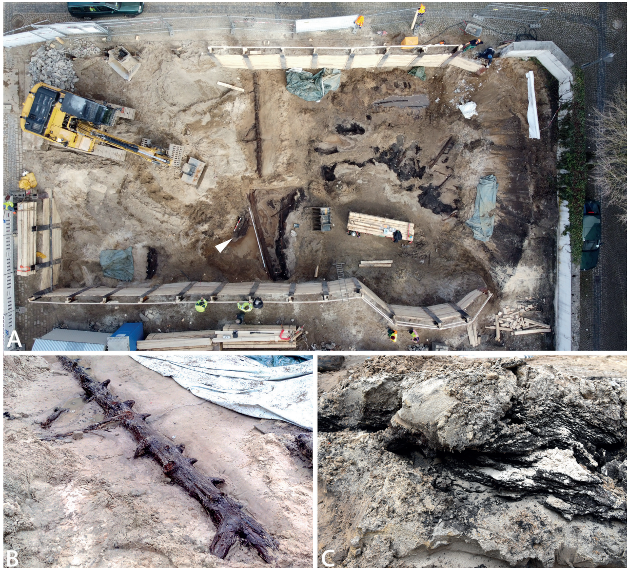
Fig. 2: Excavation site in Paderborn-Schloß Neuhaus. A Overview of the entire site with the locality of the moss findings analysed in this study (arrowhead). B One of the logs of Scots Pine ( Pinus sylvestris ). C Moss cushion on one of the logs.