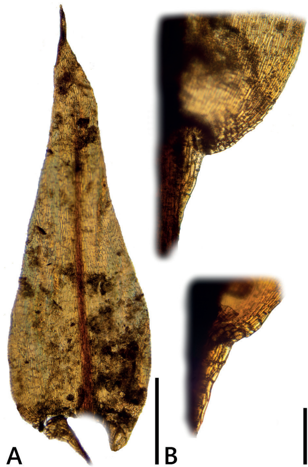
Fig. 3: Sarmentytnum tundrae from Paderborn sample no. 9 (WMNM P88099; Table 1). A Leaf. B Leaf decurrencies. Scale bars: 500 \mu m (A), 100 \mu m (B)

The fourth species that was confidently identified from the present site, Sarmentytnum tundrae , occurs in central and northern Fennoscandia, Iceland, Russia, Estonia and Latvia (and the Arctic) (Hedenäs 2003). In addition, one extant locality was recently found in the