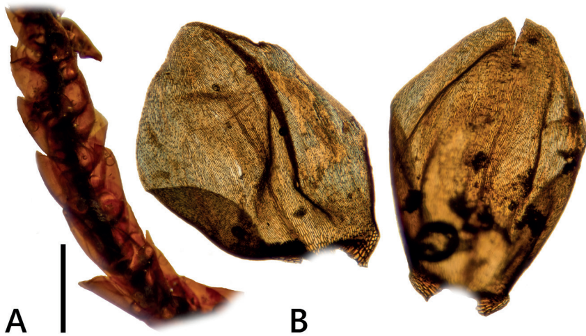
Fig. 4: Drepanocladus trifarius from Paderborn sample no. 4 (WMNM P88094; Table 1). A Shoot. B Leaves. Scale bars: 3 mm (A), 500 µm (B)

were later followed by alder (Averdieck et al. 1990). Towards the end of the Holocene climatic optimum (c. 9,000 to 5,000 cal. BP) bogs started to develop, and the mineral-rich fen habitats gradually disappeared (Averdieck et al. 1990).