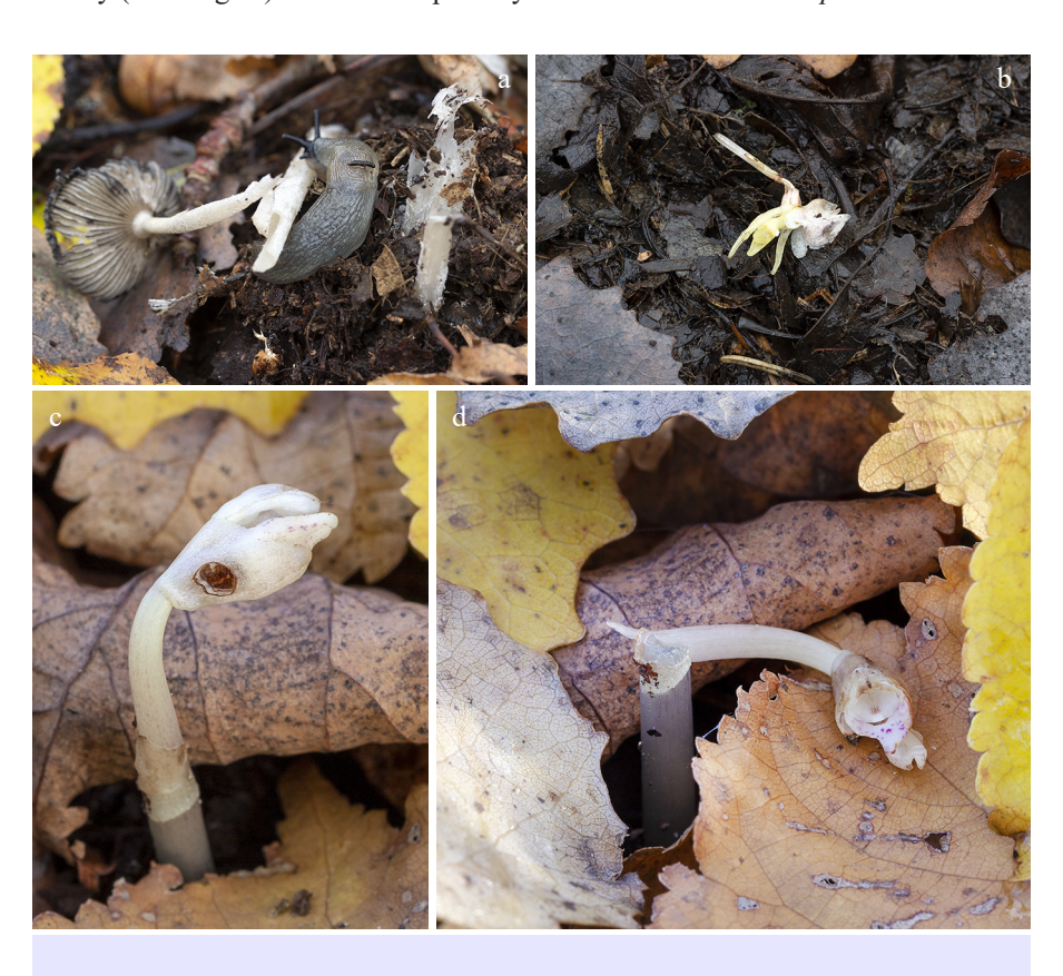
Fig. 7a: Krynickillus melanociphalus eating Coprinus sp. Figs. 7b - 7d: Slug damage to Epipogium aphyllum plants.

Whilst it might have been expected that the temperatures during these plants' emergence would have prevented slug predation, this was not the case. During the early part of emergence, daytime temperatures were reaching up to 10°C and three of the six plants were eaten or broken by slugs between the end of October and mid-November, whilst still in bud. Another three-flowered plant was eaten on 3<sup>rd</sup> or 4<sup>th</sup> November. I have recorded a lot of individuals of the non-native species, Krynickillus melanociphalus (Fig.7 below) eating Coprinus species. It is rapidly expanding in this area since first reported in Estonia in 2014, as are some Malacolimax sp. and other smaller slug species. In fact, slug presence and activity was much greater during the period of this observation than during the more usual flowering period of Epipogium , in July (and August) – this was especially the case for K. melanociphalus .