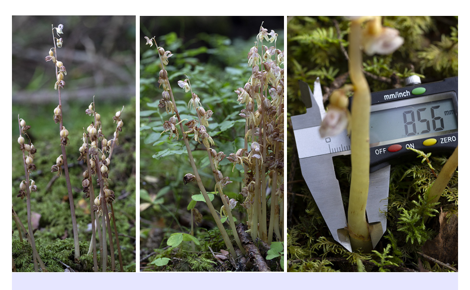
Fig. 16 One Epipogium stem with eight flowers and two stems nearby with seven flowers. Stems with diameter over 8mm are a sign of superb vitality.

It was a great thrill, then, when on 5<sup>th</sup> August 2020, we discovered a single plant with eight flowers (Fig. 16). Nearby were two plants with seven flowers and many others with five or six. It seems to be that the bigger the population, the exponentially higher the probability of finding highly vigorous plants. In Estonia at least, within smaller populations (up to 10-20 plants) even five flowers on a single stem is rare. In places with just one or two plants usually four flowers is the maximum, but more often just one or two. Width (diameter) of stem (measured at the widest point, usually just above the base) is another indicator of plant vitality. Smaller plants usually have stem widths of 1-2mm, bigger plants with four or five flowers usually 3-4mm. Stems with diameter >5mm are rare. The largest plant we measured in 2020 had a stem diameter of 8.56mm – truly remarkable for Epipogium !