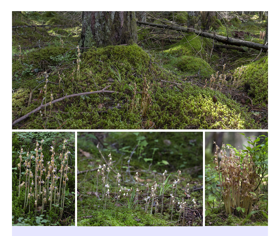
Figs. 12-15: Epipogium plants in probably the largest extant population in Europe.

In order to protect this incredible colony we will not specify the location, but it is in the eastern part of Estonia. The habitat was middle-age Spruce forest mixed with Pine and Birch. No understorey, with clear visibility through the trees for tens of metres. Nearby some forestry work had been carried out. In August it was very dry there, but under leaf litter and moss there was still some humidity. We discovered other achlorophyllous orchid species there – Neottia nidus-avis and Corallorhiza trifida , but both were massively outnumbered by Epipogium .