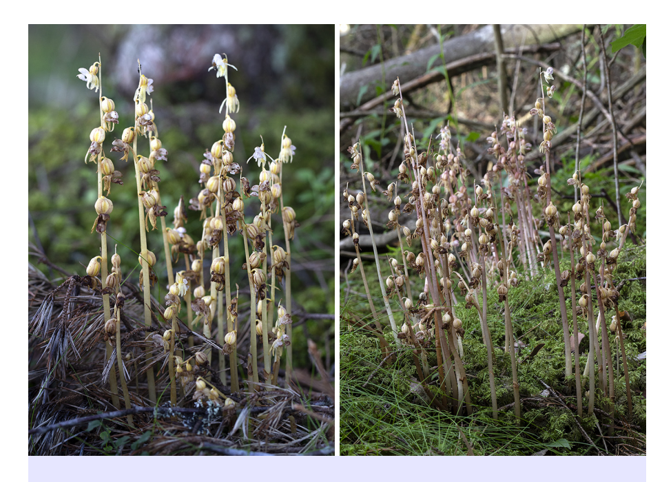
Fig. 17 Epipogium plants with extensive fruit set.

There are many scientific works and books that mention poor or mostly non-existent fruit set of Epipogium . This new, large colony changed our perception of this commonly accepted belief. Fruit set rates were surprisingly high, by visual observation a minimum of 80% (Fig. 17), regardless of location within the colony, the size of plants or number of plants in a group. Given the number of flowering plants (2609), this means many thousands of seed capsules, each containing thousands of small seeds approximately 0.2-0.3mm in size. We measured some capsules and they were huge, the biggest ones up to 15mm in diameter, like small cherries!