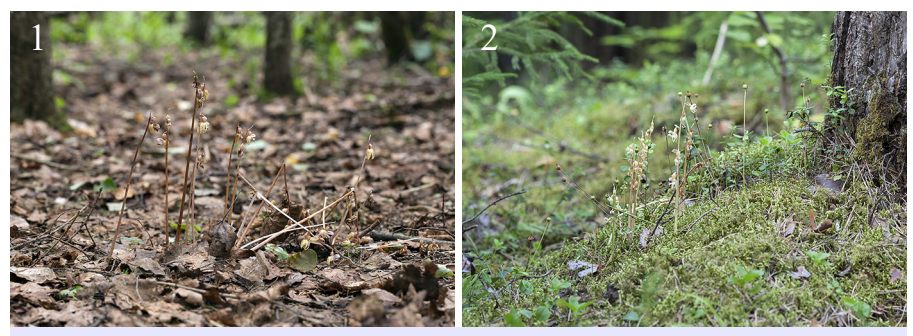
Fig. 1: Epipogium aphyllum growing out of old leaf litter. Fig. 2: Epipogium aphyllum growing on green moss.

In Estonia the Ghost Orchid Epipogium aphyllum is known from approximately 20 locations scattered throughout eastern and central regions, with additional occurrences on the islands of Saaremaa and Hiiumaa to the west. It typically occurs in moist Picea abies and Populus tremula forests, usually with minimal understorey, growing out of old leaf litter (Fig. 1) but sometimes on green moss (Fig. 2).