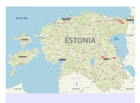
Fig. 18 Location of study sites

to that of either neighbouring populations or others elsewhere in the country. To demonstrate this, I chose two pairs of locations close to each other, in different regions: A & B in north-east Estonia and C & D in the south-east of the country (Fig. 18). A & B have the same temperatures as each other throughout the year, the same amount of sun and clouds and the same amount of rain and humidity. The same is true for C & D (distances between these places: A-B=5km; B-C=110km; C-D=33km).