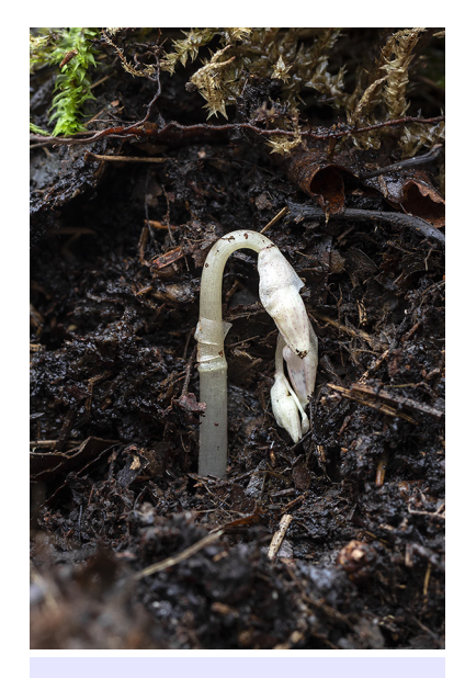
Fig. 8: Epipogium aphyllum plant with curled back stem.

The stolons of Epipogium are very thin and delicate, breaking even with the most careful movement of the associated leaf litter, or even the slightest accidental contact.