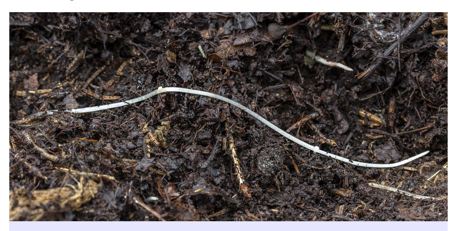
Fig. 9: Stolon of Epipogium aphyllum with two bulbils.