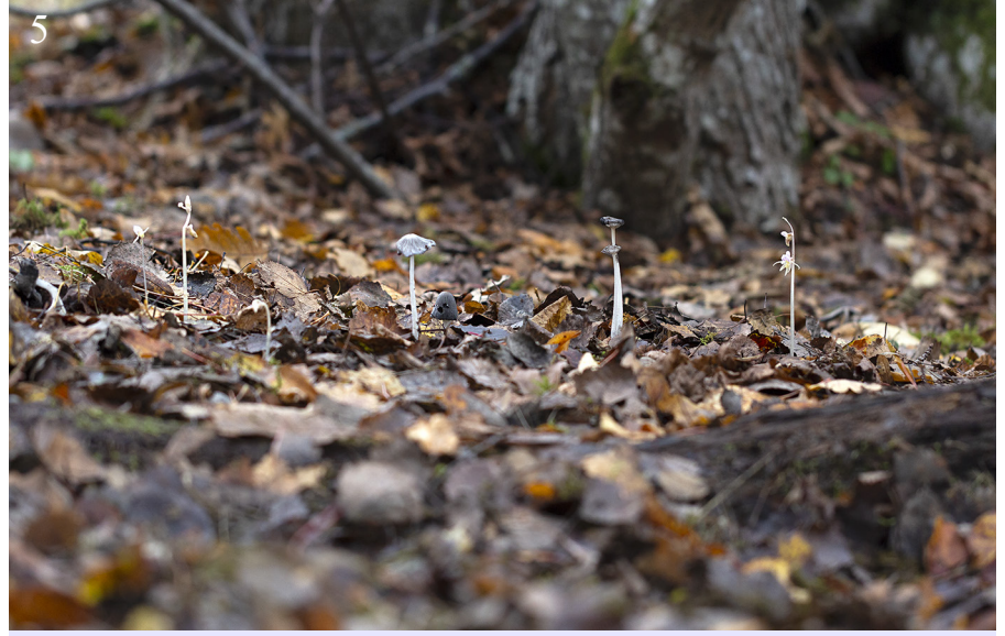
Figs. 3 & 4: Epipogium aphyllum coming into bud among autumnal leaf litter. Fig. 5: First Epipogium aphyllum flower opening amongst six plants.

The weather during the interim had minimum temperatures of 1-2°C at night and a maximum of 6-11°C during the daytime, with the 24h average being 6-7°C. The plants were in my experience medium-sized with up to three flowers, reaching 14cm on 29<sup>th</sup> October, with a stem diameter of 3.5mm, so were no different in size or vitality to those flowering during the usual period.