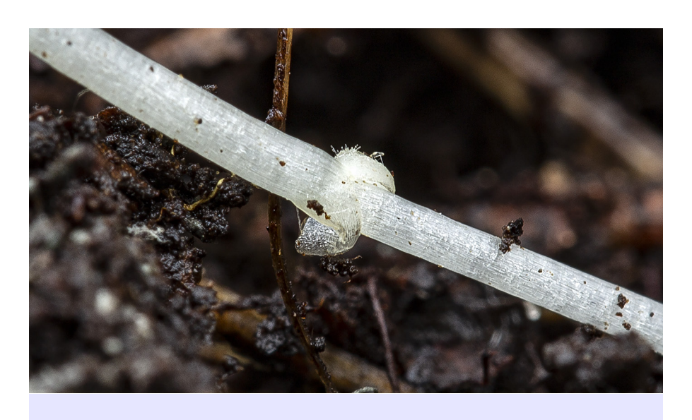
Fig. 10: Epipogium aphyllum bulbil with new rhizomes.

These delicate structures are the means by which the species reproduces vegetatively, so it is not difficult to imagine the effect that even the most careful footfall will have on the spread of Epipogium among the soft, damp substrates in which it flourishes best. For this reason, sites for this species should not be visited repeatedly or by large numbers of people.