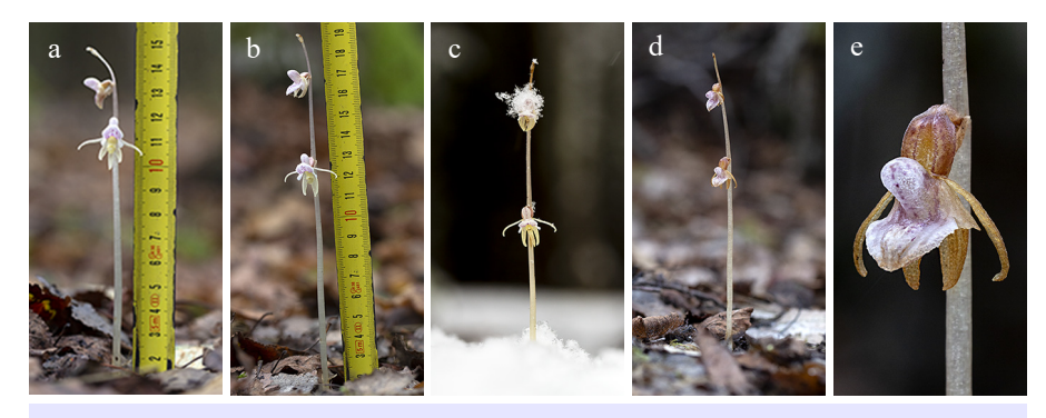
Fig. 6: Lifecycle of an individual Epipogium aphyllum plant.

One of the plants, with two flowers, was measured at 15cm tall on 1st November, with the top flower still in bud, and by 7th November it was 19.3cm tall with the top bud having now opened. Another stem, with three flowers and with the top flower still in bud on 7th November, opened the third flower on 21st November (Fig. 11). In the interim, one night was -1 to -2°C followed by another at -2 to -4°C, with corresponding daytime temperatures reaching +1°C and +3°C respectively. Subsequently, the weather warmed up, but two stems survived, in flower, until the 9th December. The day before that there was a severe arctic blast (-6.5°C on the night of the 8th December) and the stems broke during the evening of the 9th December, having lost their colouration following the harsh night. This record is remarkable in a number of ways. One open flower lasted 41 days, perhaps the longest of any orchid species anywhere in Europe. The Ghost Orchid can withstand very cold temperatures when above ground, even below freezing for short periods, and a short period of snow does not adversely affect growth.