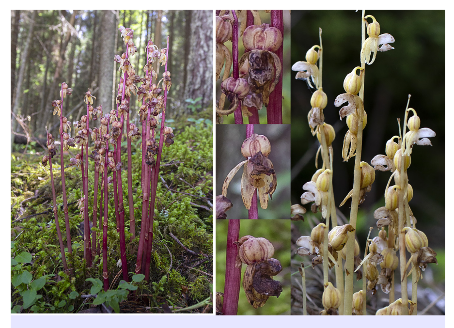
Fig. 20 "Epipogium aphyllum forma rosea"

Given how rare this reddish form is, it is difficult to decide whether this is just coincidence or a more consistently occurring phenomenon. It is certainly worth further investigation should more plants of this form be discovered, and subsequently set seed. Maybe therefore, if the yellow form of Neottia nidus-avis is called forma sulphurea , this reddish form should be called Epipogium aphyllum forma rosea .