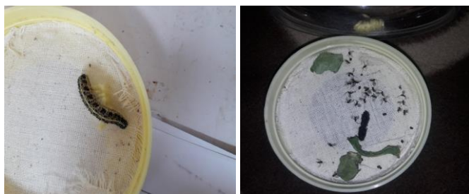
(a) Parasitized larva