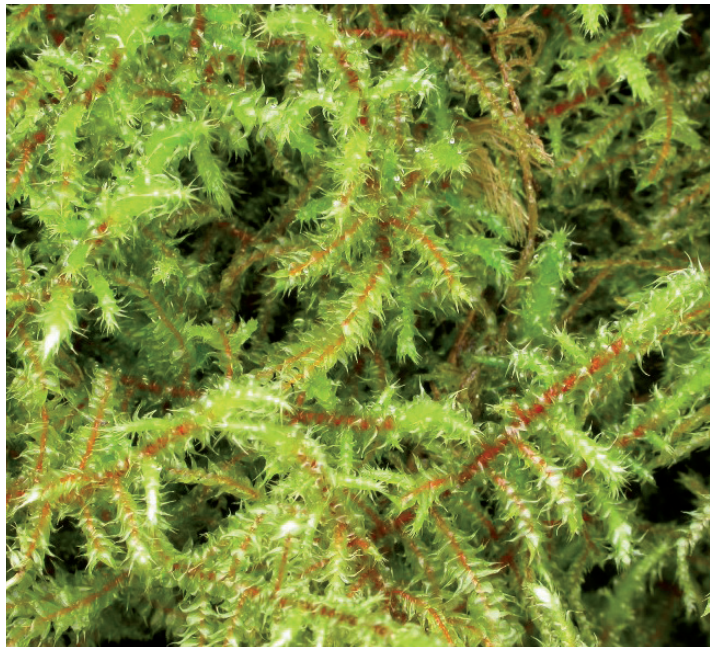
△ Habit and close-ups of R. subpinnatus . Sam Bosanquet

rutabulum , Cirriphyllum piliferum , Eurhynchium striatum , Kindbergia praelonga , R. loreus , R. triquetrus , Thuidium tamariscinum and the liverwort Plagiochila asplenoides . All colonies are on the floor of broadleaved woodlands with ash ( Fraxinus excelsior ), hazel ( Corylus avellana ) and oak ( Quercus sp.) as the principal trees. Three distinct niches on the woodland floor