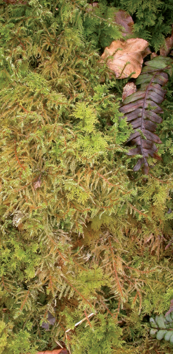
◁ R. subpinnatus