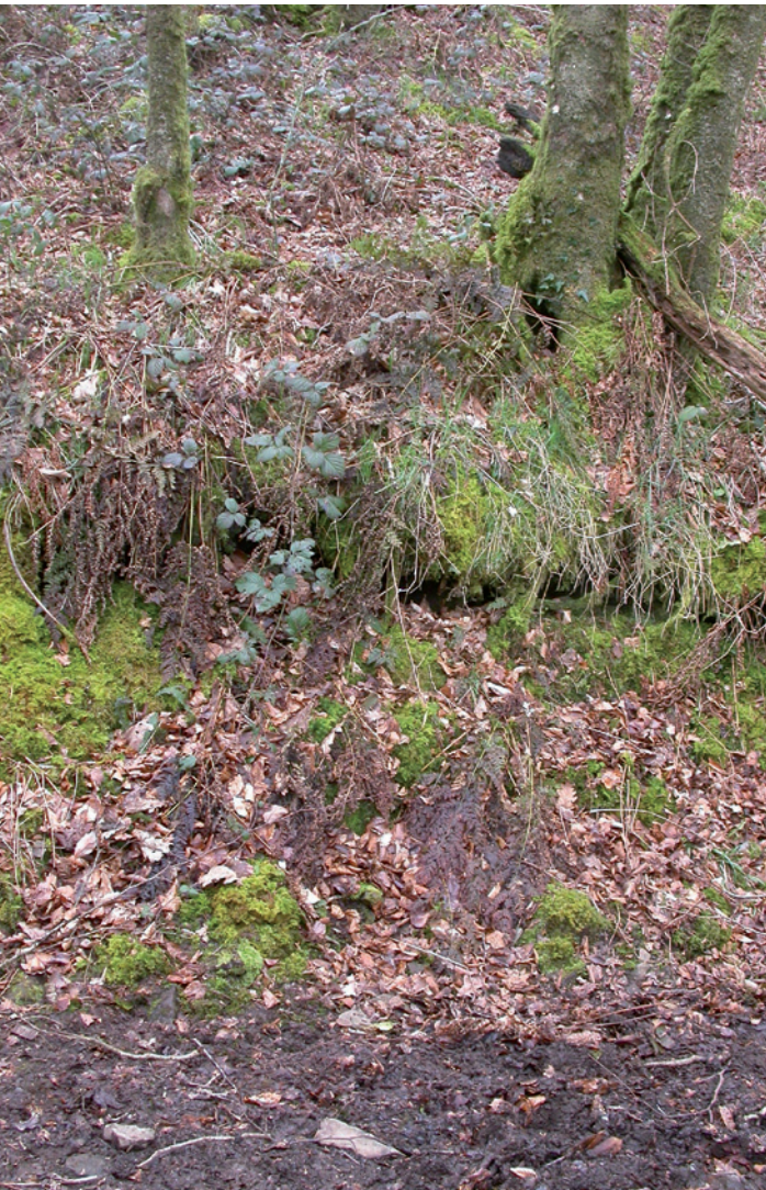
△ Habitats of R. subpinnatus in Nedd Fechan (top) and the Cwm Gwaun valley (bottom). Sam Bosanquet

are exploited: flat ground immediately adjacent to a river, where flooding is likely to be annual; steep ground above the river, with records up to 20 m above the river level; and steep banks by footpaths, which tend to be just above the flood zone. The last of these niches is highly vulnerable to any footpath diversions or widening works.