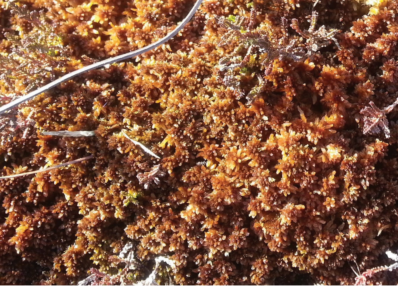
<Fig. 1 (opposite page). Sphagnum fuscum with Betula nana at 600 m in Dundreggan Forest. G.P. Rothero.