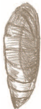
Eggs on the underside of a pine needle

Each larva goes through 5 stages of growth, or instars, which are separated by moults. From the third instar onwards the larva has a characteristic green colour with yellow-white stripes running along its body, and this provides near-perfect camouflage amongst the pine needles where it feeds. It can take up to 4 months for the larva to become fully-grown, and it is then about 26 mm long. As with other moths in the Geometridae family, the larva only has legs on its front and back segments and it moves by curving its body into a loop and then advancing forwards. It is this action which gives rise to its common name of pine looper.