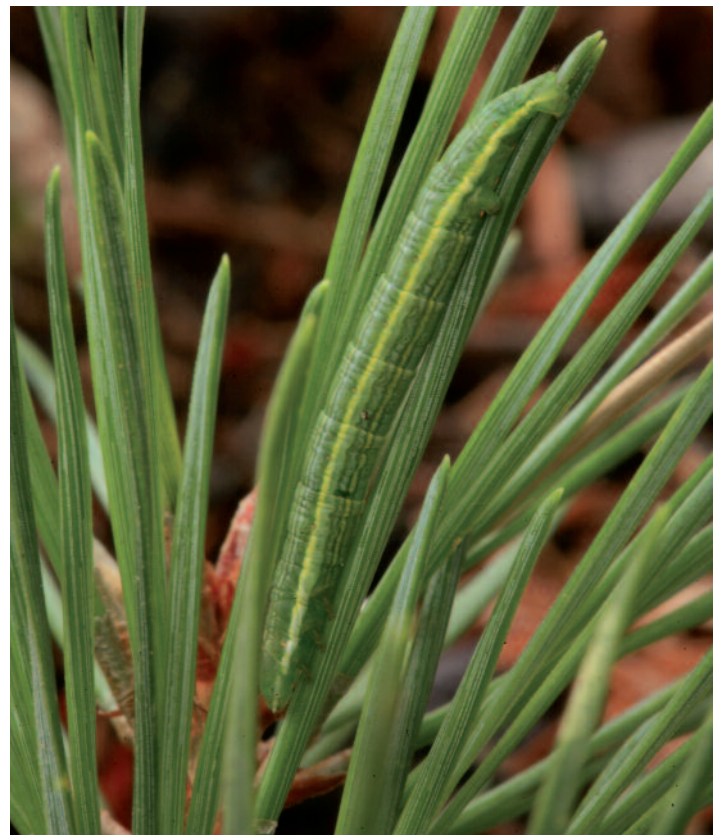
Pine looper moth caterpillar feeding on a Scots pine on Dundreggan.

Considered a serious pest by commercial foresters, the pine looper moth is a classic example of a species that lives in a healthy balance within a natural ecosystem (the Caledonian Forest in Scotland), but that becomes a problem in an artificial monoculture that is ‘managed’ to maximise economic productivity.