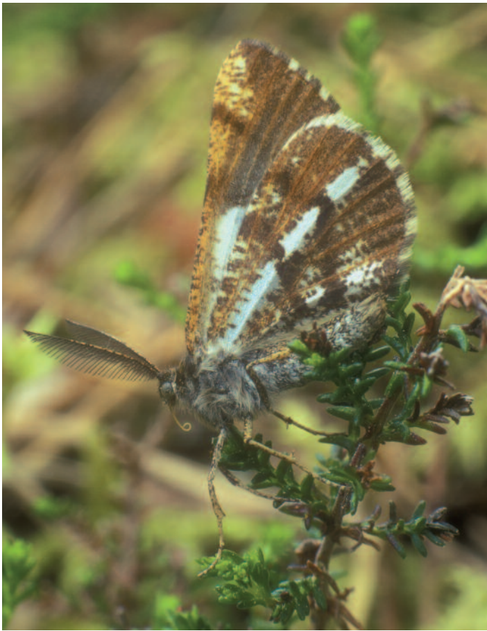
Pine looper moth, with its proboscis visible, on a crowsberry plant ( Empetrum nigrum ) in Glen Affric.

June and the middle of August. Larvae hatch from the eggs after about two weeks and initially are a greyish-green colour with a brown head.