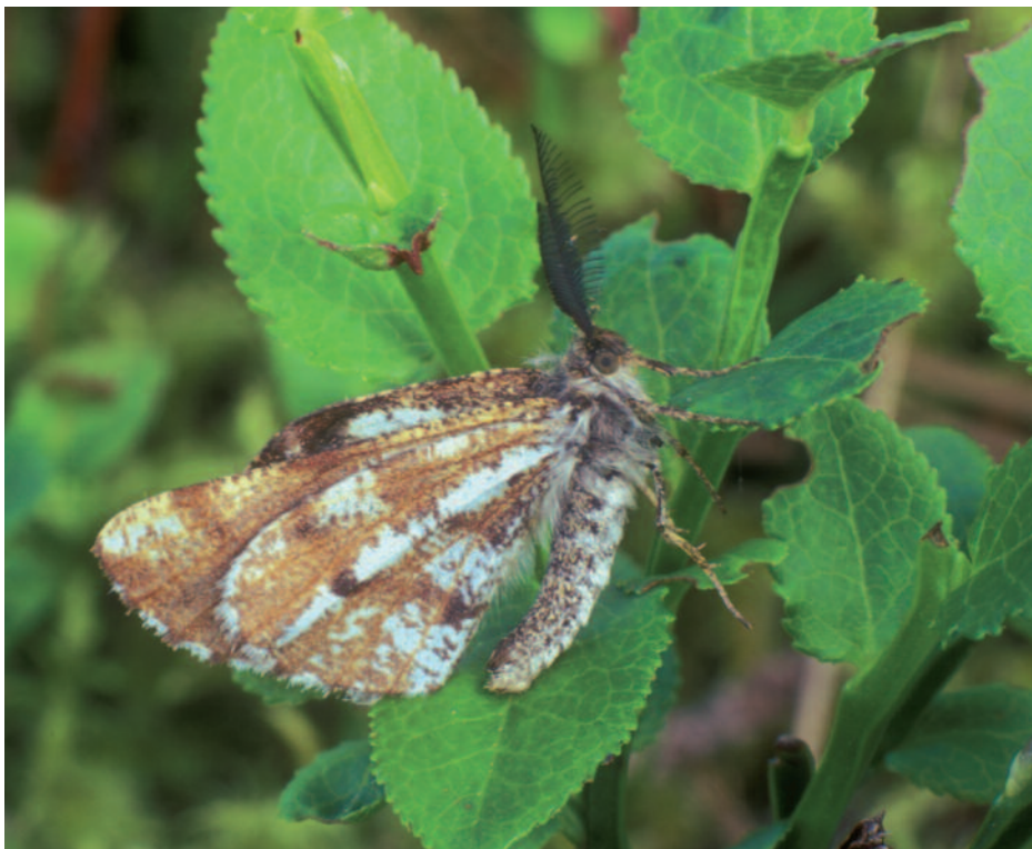
Male pine looper moth on a blaeberry plant ( Vaccinium myrtillus ) in Glen Affric.