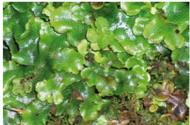
A liverwort Conocephalum conicum. Dunskey Glen, July 2003.