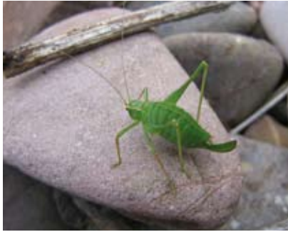
Speckled Bush Cricket. Ravenshall, August 2007 (Pete Robinson)

Not all invertebrates have the same needs and a simple uniform approach to habitat management may not maintain biodiversity, but there are a number of basic principles of invertebrate conservation: