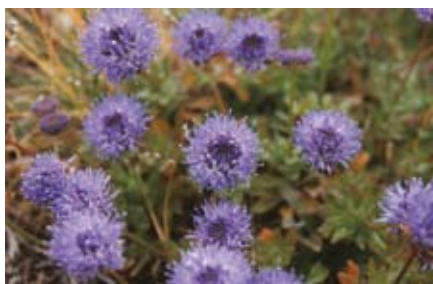
Sheep's-bit, Killantringan Bay, July 1998.

Unlike non-flowering plants there is a general decrease in the number of species the further north one goes in the UK. This is