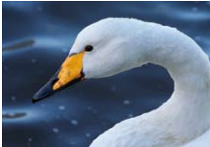
Whooper Swan. (Gordon McCall)

Approximately 700 species of bird are known from Europe, and 514 of these have been recorded in Scotland. This is a relatively small total compared to parts of Africa and South America, but British birds are the most highly studied species group in the world. In Dumfries & Galloway around 350 species of birds have been recorded. Of these, some 160 are known to have bred at some time during the last 100 years.