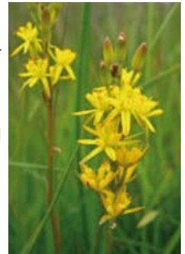
Bog Asphodel, Cree Valley. July 2007