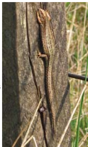
Common Lizard on fence post at Drumlanrig, April 2007.

Dumfries & Galloway is the only part of Scotland to support all Scottish native species of reptile and amphibian: Common or Viviparous Lizard Zootoca vivipara , Slow Worm Anguis fragilis , Adder Vipera berus , Great Crested Newt Triturus cristatus , Smooth Newt Lissotriton vulgaris , Palmate Newt Lissotriton helvetica , Common Toad Bufo bufo , Natterjack Toad Epidalea calamita , and Common Frog Rana temporaria . All these species occur most frequently along the Solway coast, but Common Lizard, Adder, Palmate Newt, Common Toad and Common Frog are more widespread, sometimes extending well into the Southern Uplands.