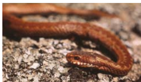
Young Adder.