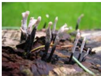
Candle-snuff Fungus Xylaria hypoxylon . Drumlanrig, September 2006. (Peter Norman)

on the trunks of elms in rural, wayside and parkland situations. Loss of unimproved grassland and deadwood has had a similar impact on many fungi.