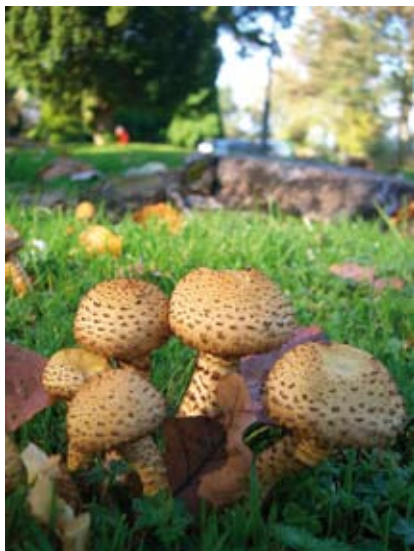
Shaggy Scalycap Pholiota squarrosa in Castledykes Park, Dumfries. October 2007. (Peter Norman)

Although some fungi resemble plants, molecular evidence suggests that they are more closely related to animals. However, they are sufficiently different to both to warrant their own kingdom. Most fungi grow in the form of microscopic filaments called hyphae that extend and branch at their tips to form a vast network or mycelium. The familiar mushrooms are merely the fruiting structures that arise from such a network, but many fungi do not have this shape.