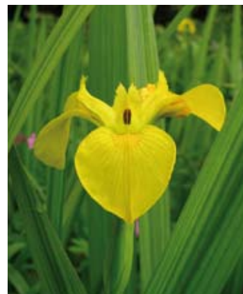
Yellow Flag Iris, Brighthouse Bay, June 2004. (Peter Norman)

Native species make up around 70% of our wild flora, the remaining 30% being introduced to the region, either accidentally or deliberately by man. The proportion of the latter group is likely to increase with human activities.