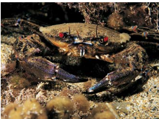
Velvet Swimming Crab - almost all crustaceans are marine or aquatic species. (Paul Naylor)

Given that many terrestrial invertebrate species favour warm and relatively sunny conditions, Dumfries & Galloway's geographical position with a long south-