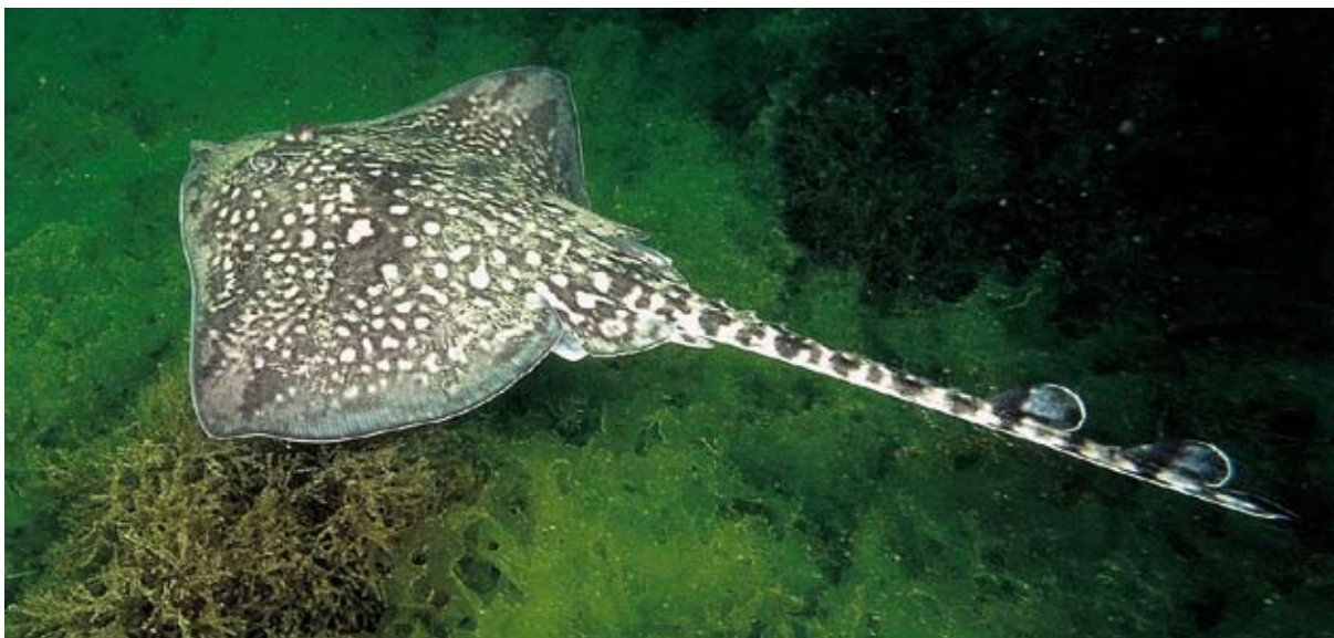
Thornback Ray, common in both deep and shallow coastal waters. (Paul Naylor)