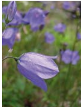
Harebell, Ravenshall. July 2007.