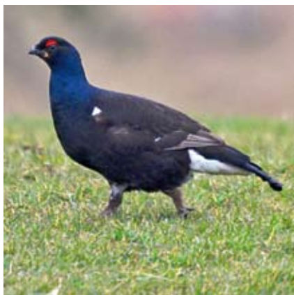
Black Grouse

The most important habitats in the region for birds are the coasts and estuaries, and the many freshwater wetlands. Collectively these support internationally important numbers of overwintering and migrating wildfowl and wading birds. The Solway is regarded as one of the most important estuaries for birds in Europe and is particularly associated with Svalbard Barnacle Geese Branta leucopsis , with virtually the entire world population wintering on the Solway. The region's uplands are also important for breeding Hen Harriers Circus cyaneus and Peregrines Falco peregrinus . A number of wetland and upland sites have been designated as Special Protection Areas for their bird interest.