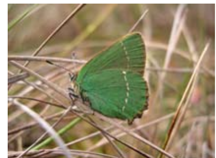
Green Hairstreak butterflies are most common in the region on raised bogs. Catherinefield Moss, May 2007.