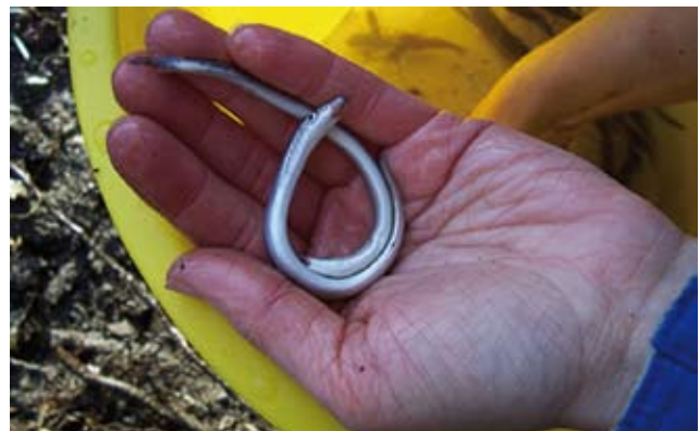
Lamprey from Water of Fleet.

The coastal waters of Dumfries & Galloway do not support a large commercial fishery. Recreational fishing of both coastal and freshwaters is, however, more important to the local economy. Direct expenditure on angling was estimated to be worth almost £6.75m to Dumfries & Galloway in 2003, including more than £1m on coarse fishing. In addition to Salmon Salmo salar and Trout Salmo trutta , game fish include the Grayling Thymallus thymallus introduced to the Nith and Annan. Coarse species include Pike Esox lucius , Perch Perca fluviatilis and Roach Rutilus rutilus .