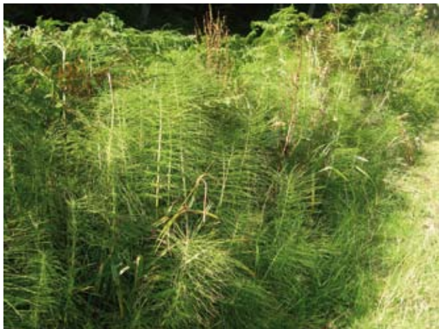
Great Horsetail. Port Kale, August 2006.