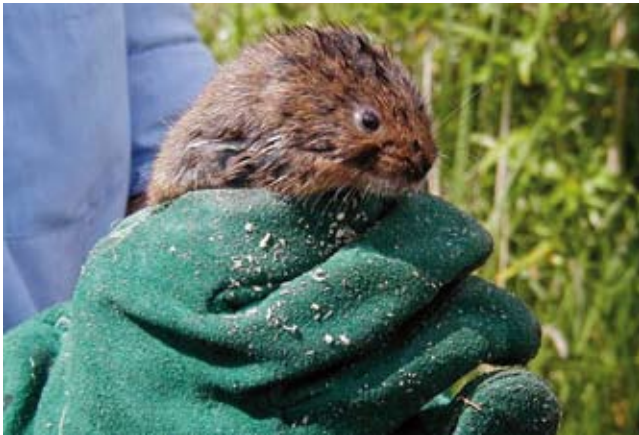
The current status of Water Voles in Dumfries & Galloway is unclear. (Environment Agency)