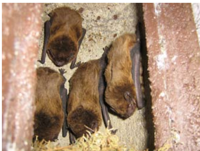
Leisler's Bats in box at Buchan Wood, Glentworth.