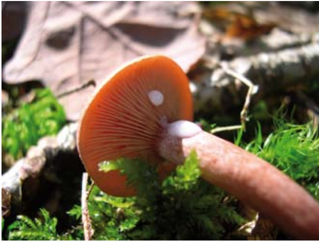
Curry-scented Milkcap Lactarius camphoratus , one of many species that exude a milky liquid from the gills. Hills Wood, September 2006. (Peter Norman)

Particularly important habitats for fungi include sand dunes, unimproved grasslands, and upland heaths; with the addition of coastal cliffs, inland rock outcrops and even man-made walls for lichens. However, woods and other habitats with trees are the best of all. Birches, willows, pines and old oaks are especially good for fungi and Ash, Hazel, Wych Elm and Sycamore for lichens, though some species, including rare and threatened ones, occur in association with other trees.