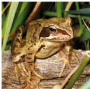
Common Frog. Lochmaben, June 2007. (Paul McLaughlin)

Some 85 species of non-marine reptile and 45 species of amphibian are found in Europe. Mainly for climatic reasons, Britain has only 6 non-marine native reptiles and 6 native amphibians, and though all 6 amphibians occur in Scotland, only 3 of the reptiles do so. In addition there are records of a few introduced species (of which 1 or 2 species in England may prove to be native), and records of 5 species of sea turtle in British waters.