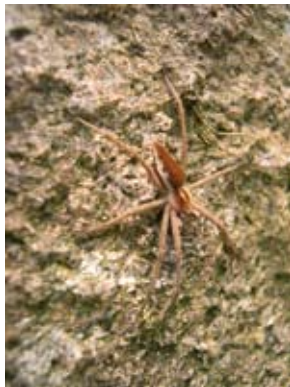
Nursery-web Spider Pisaura mirabilis. Dalbeattie Forest, May 2006.