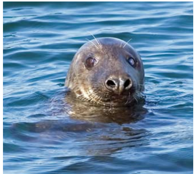
Grey Seal (Gordon McCall)