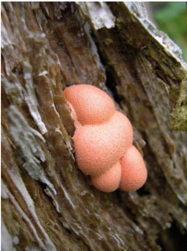
A slime mould Lycogala sp. on decaying wood. (Peter Norman)

The principal importance of Protozoa is to control the numbers and biomass of bacteria. They are also important as parasites and symbionts (where both partners benefit from the relationship) of multicellular animals.