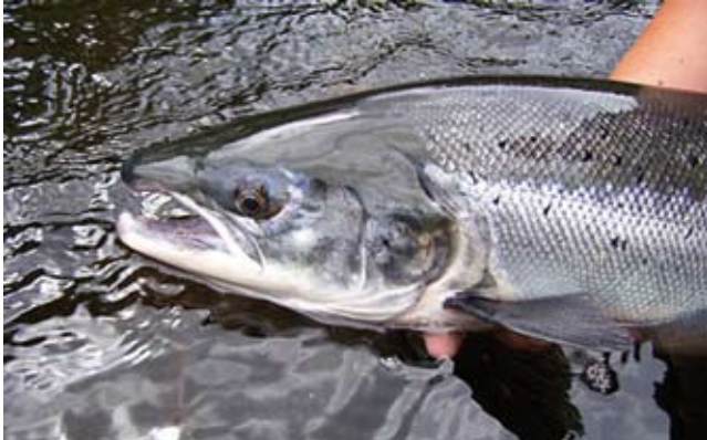
Atlantic Salmon from the River Dee. (Galloway Fisheries Trust)