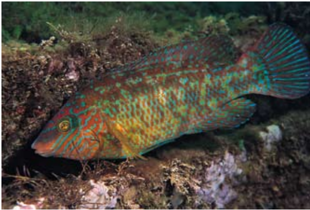
Corkwing Wrasse, an abundant fish of shallow waters on rocky coasts. (Paul Naylor)