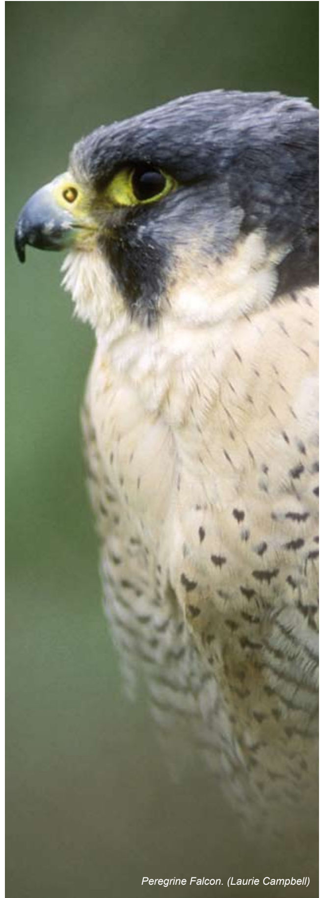
Peregrine Falcon. (Laurie Campbell)