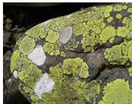
Map Lichen Rhizocarpon geographicum. Whithorn, August 2007. (Peter Norman)

Lichens consist of a fungus and an alga that live in close association with each other. The alga manufactures food through photosynthesis, whilst the fungus forms the main body of the lichen and provides a stable, protective environment for its alga.