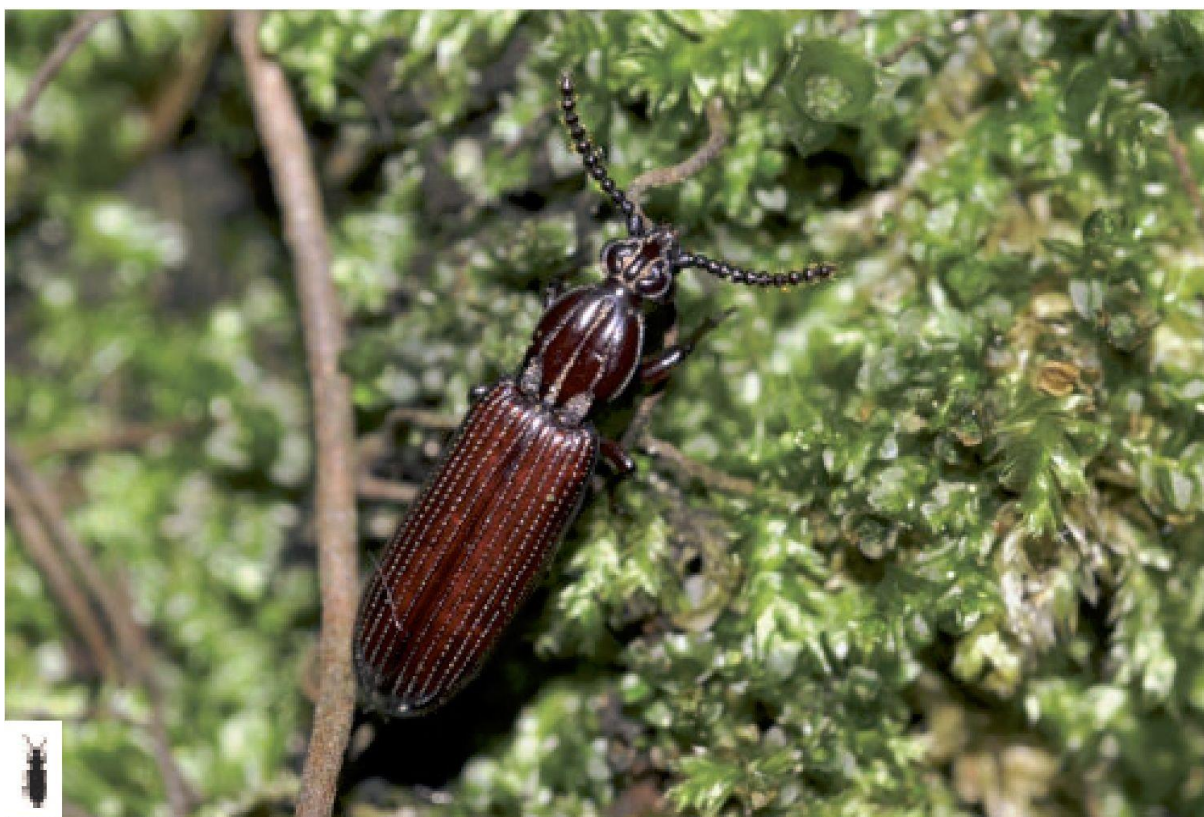
Photo 2 Rhysodes sulcatus on an exposed patch of moss growing on a decaying log

Adult form of Rhysodes sulcatus cannot be mistaken for other indigenous insect species (provided the individual is carefully looked at, applying a 5-fold magnitude at the least).