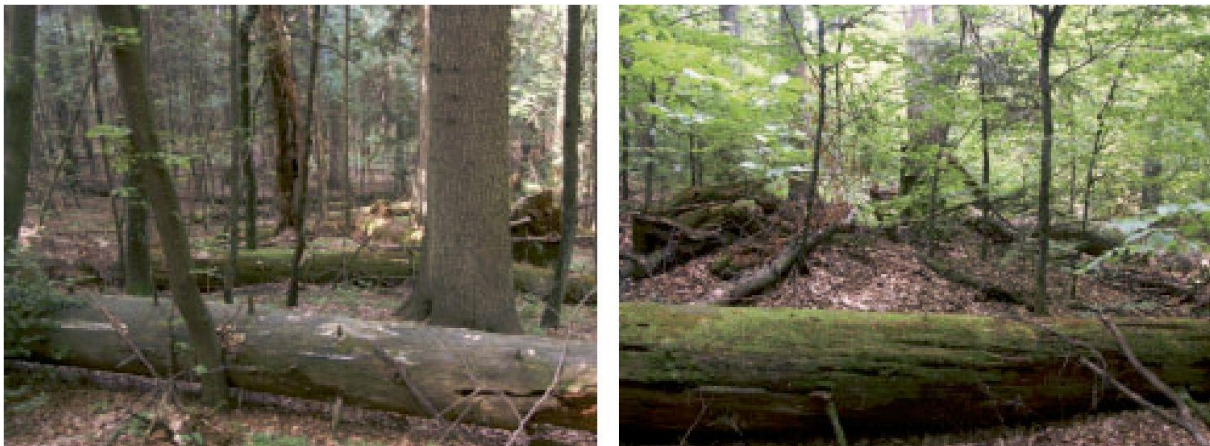
Photo 3 Rhysodes sulcatus ' habitat: fir forest (left), beech forest (right)

Rhysodes sulcatus preferably thrives in old, primeval and natural forests (Fig. 3), that have a diversified species structure (both in terms of age and species, adapted to local biogeographic conditions), rich in various forms of deadwood (with a high share of large timber) in different stages of decomposition (ca. 5% stand volume as a minimum, optimum share of deadwood above 15%). This beetle is obligatory saproxylic, an actual primeval forest relic (not found in forests excessively altered by silviculture, even those with proper habitats for growth; only nearly-extinct populations may be found in forests that have been relatively recently transformed - to a rather minor extent). In such forests, mainly microhabitats composed of deeply decayed and humid (mainly lying) stumps with diameters of over 20 cm are colonised. Colonisation of primarily large timber (stumps with a diameter of over 40 cm), regardless of the age of decaying tree, has been observed.