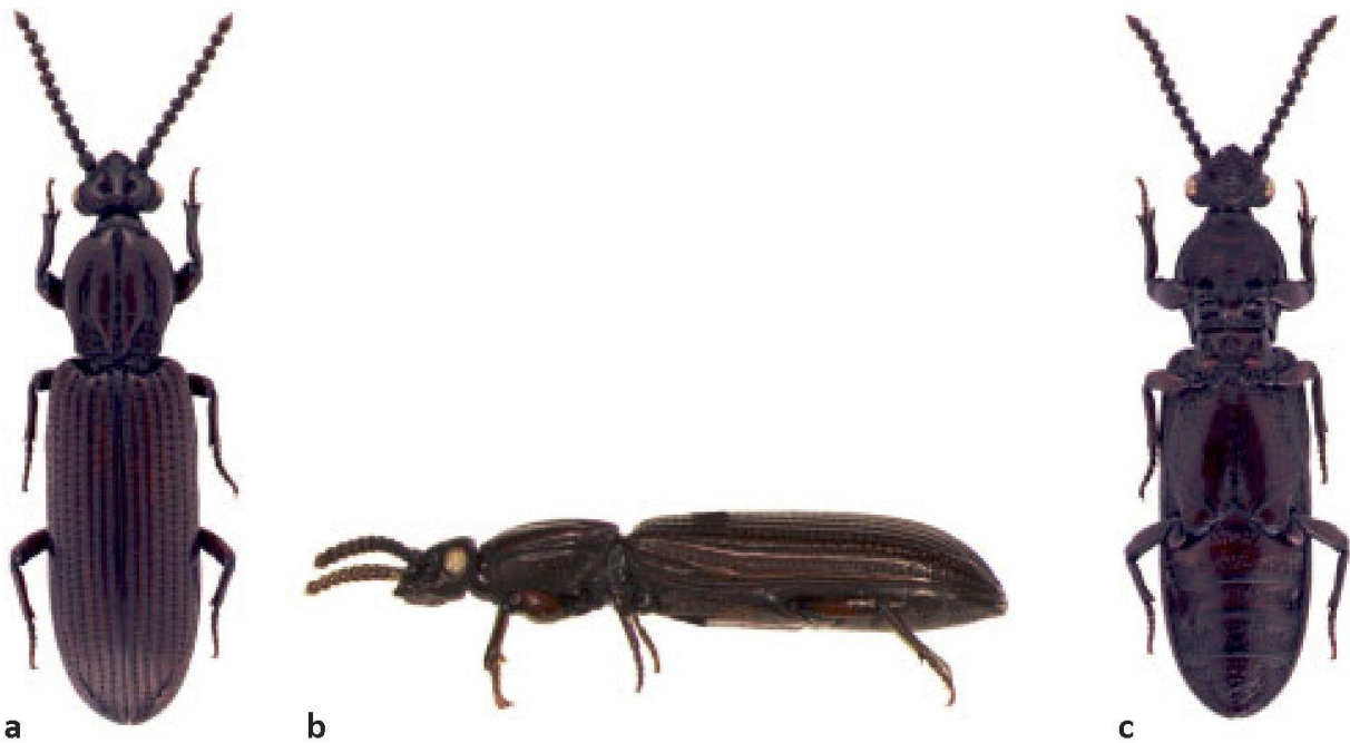
Photo 1 Body profile of Rhysodes sulcatus : a) view from above; b) side view; c) view from below