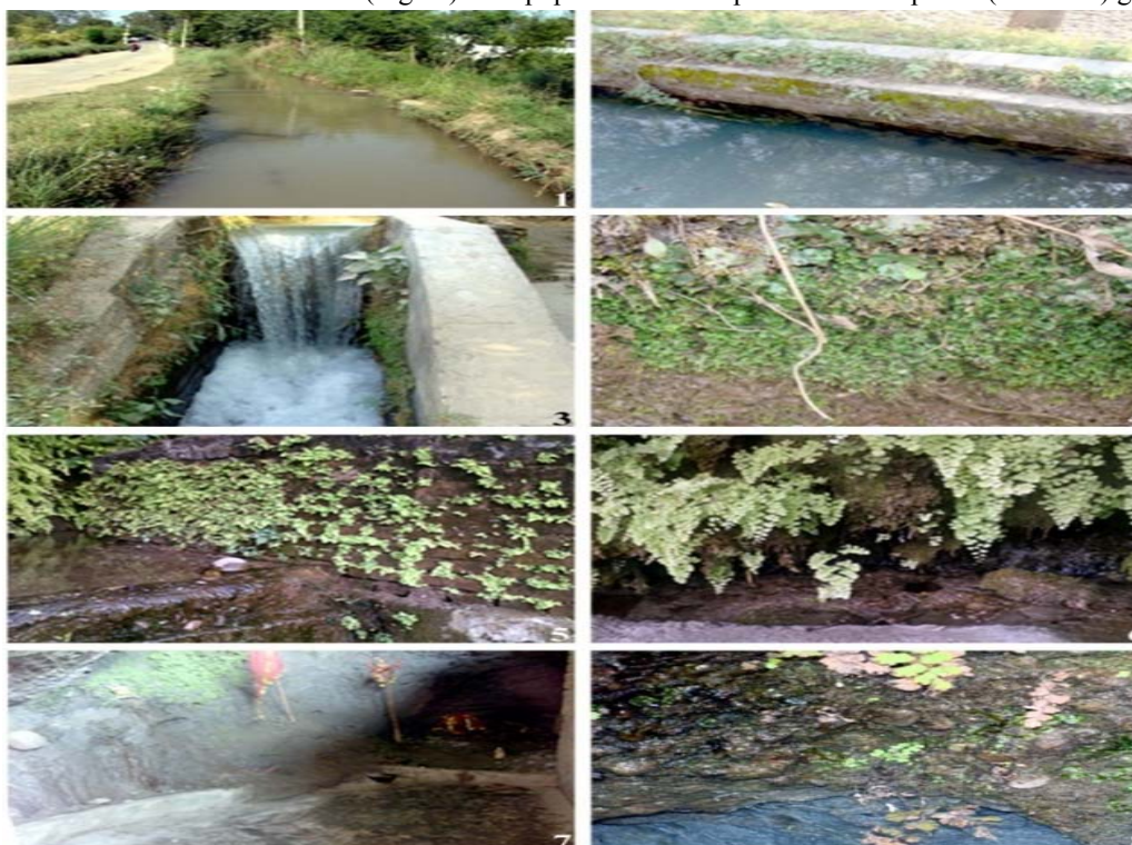
Figs. 1-8: Various habitats at Nagbani (Figs.1-5), Jib (Figs.6 and 7) and T-Morh (Fig.8); Figs. 2-4: Hepatics inhabiting brick wall (Fig.2), cemented wall (Fig.3) and moist soil (Fig.4); Figs. 5-8: Hepatics inhabiting brick wall (Fig.6), on the rock (Fig.7) and Cave (Fig.8).

5-6 (Fig.13) and 7-10 (Fig.14) archegonia in populations KA NB1, KA NB2 and KA NB3 respectively. Male plants were recorded in only one population (KA NB3). Antheridia appeared during April and were seen as light green circular spots scattered irregularly on the thallus (Fig.15) and were embedded in the thallus in antheridial chambers (Fig.16). The population which produced male plants (KA NB3) grew at a