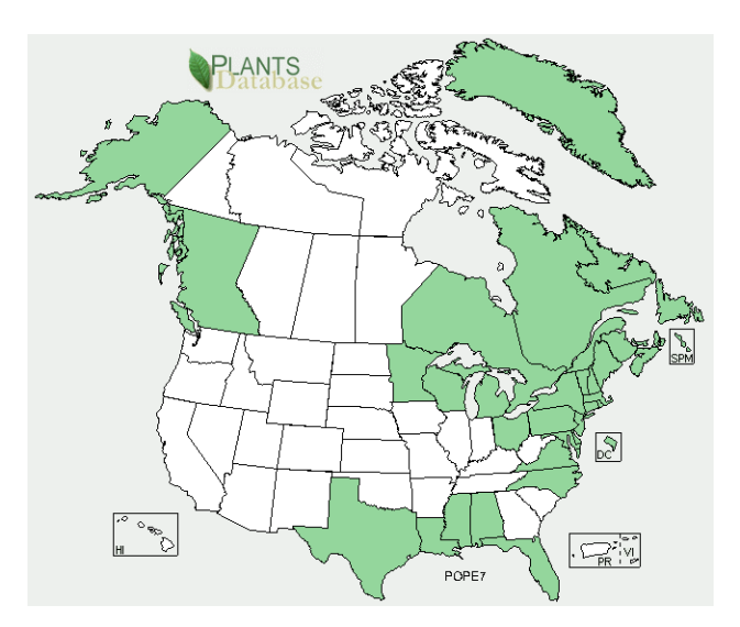
Claspingleaf pondweed distribution from USDA-NRCS PLANTS Database.

Claspingleaf pondweed is a submerged, rooted, flowering aquatic plant that grows in alkaline, brackish, and freshwater lakes, streams and estuaries. Substrate conditions are often low in organic content forming a firm muddy bottom or sand-based sediment in reasonably slow moving waters. Plants tend to be darker green colored in shallow waters and are a paler green in deeper water (Bergstrom et al. 2006).