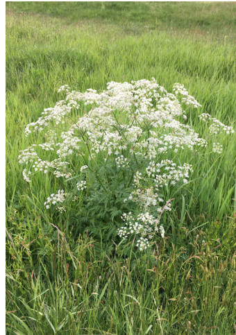
Full bloom in spring