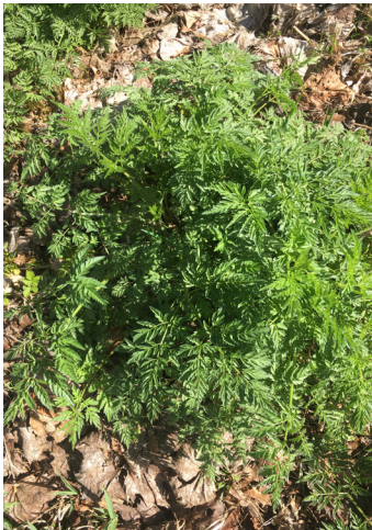
Leaf emergence "mushrooms" in late winter/early spring