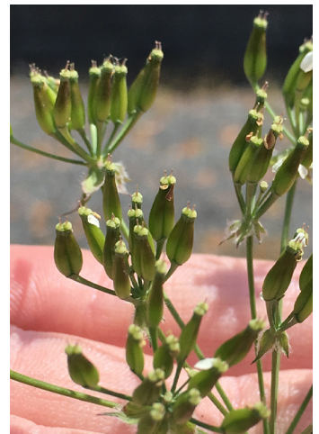
Seeds CREDIT: ISCMV