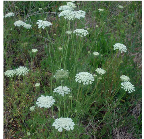
Queen Anne's lace / wild carrot