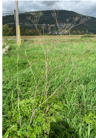
Fall/winter with dead stems