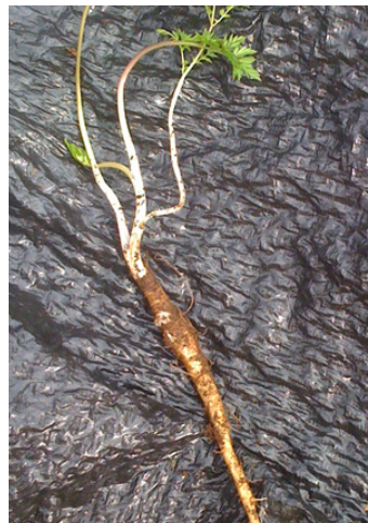
Wild chervil plant with taproot (this plant had been mowed repeatedly for several years, which encourages taproot growth)