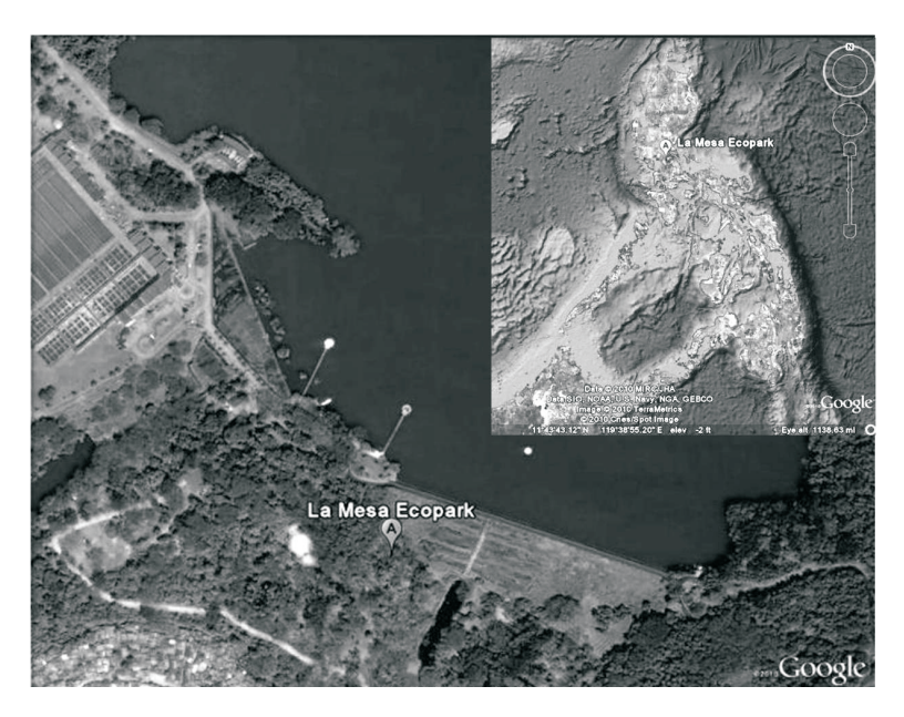
Figure 1. The study site: La Mesa Ecopark situated within the La Mesa Watershed in Quezon City, Philippines.

Diversity and distribution of plasmodial myxomycetes - Sittie Aisha B. Macabago et al.