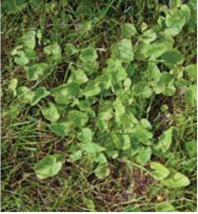
Creeping bellflower can be an aggressive weed in gardens and lawns.

Hardy in zone 3-9, creeping bell-flower is naturalized in many parts of North America, and is classified as a noxious weed in some states or provinces. It cannot be recommended as a useful ornamental plant; avoid introducing it in your garden! It is often found in disturbed areas, along roadsides, in fields and forest plantations, and as a lawn weed. This plant is often inadvertently spread in contaminated commercial seed and nursery stock.