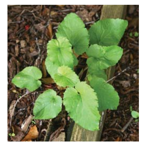
A young creeping bellflower plant.