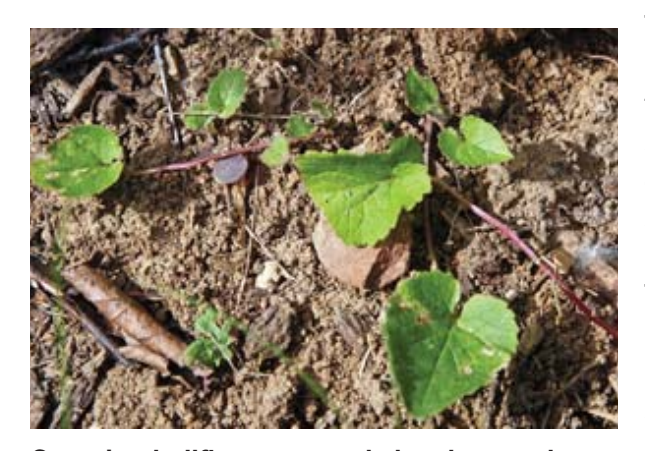
Creeping bellflower spreads by short stolons.

The flowers are followed by spherical seed capsules that each contain several small, shiny, tan to light brown seeds that ripen in late summer and fall. The light-weight, elliptical seeds have small wings or ridges for wind dispersal. Vigorous plants can produce up to 15,000 seeds annually and self-sow readily.