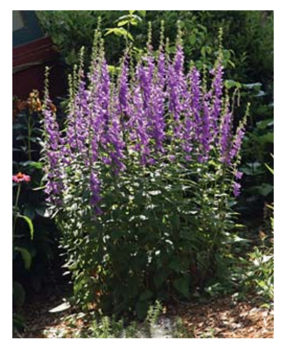
A specimen of creeping bellflower, Campanula rapunculoides, in a garden.

Creeping bellflower, Campanula rapunculoides , is a too-vigorous herbaceous perennial native to Europe, Western Asia and the Caucasus. The specific name rapunculoides , meaning like Rapunculus, refers to a now obsolete-name for a group of bellflowers, meaning "little turnip" (for the roots). One common name in Europe is rampion, after which the Old World fairy tale figure Rapunzel is named. In that story her father steals a rampion plant from a witch's magic garden to aid his wife in childbirth, and as punishment Rapunzel is exiled to a tower. Other common names include creeping bluebell, European bellflower, garden bluebell, June bell, rampion bellflower, and rover bellflower. The leaves, shoots and roots of this plant are edible, and it was once grown for culinary purposes.