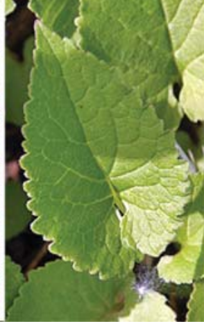
The heart-shaped leaves growing on the tall stems are irregularly toothed.

Creeping bellflower produces erect, unbranched green to purple stems 1-3 feet tall. The basal leaves are wider and heart-shaped while the leaves on the stems gradually become shorter and more narrow with shorter (or no) petioles toward the top. The largest leaves are up to 5" long and 2" wide. The opposite foliage is coarse and irregularly toothed, with small blunt teeth. The leaves are dark green on the upper surface and light green below, with short hairs along the underside of the leaf veins.