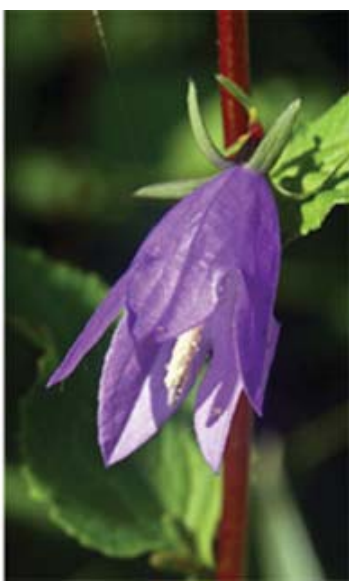
Creeping bellflower produces clusters of flowers along the upright stems, with nodding, bell-shaped flowers.