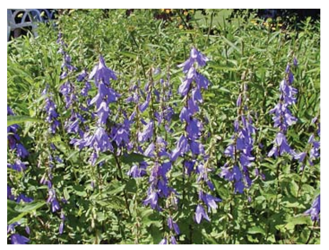
Creeping bellflower, Campanula rapunculoides , in bloom.

It was brought to North America as an ornamental, but is now considered an invasive weed by most people, despite its attractive flowers. In Wisconsin it is listed as a "restricted invasive plant." It grows in almost any soil in wet or dry conditions, reseeds readily and spreads by rhizomes and root fragments. Even the smallest root piece is capable of regenerating, so it is exceptionally difficult to eliminate by cultivation or digging out plants. In rich soil it can take over beds and move into lawns. In more difficult