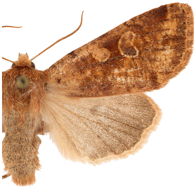
Fig. 8: Orthosia rubescens .