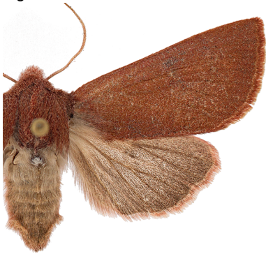
Fig. 11: Orthosia pulchella .