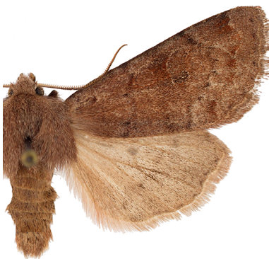
Fig. 14: Orthosia alurina .