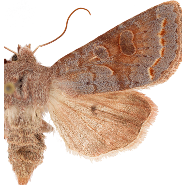
Fig. 15: Orthosia revicta .