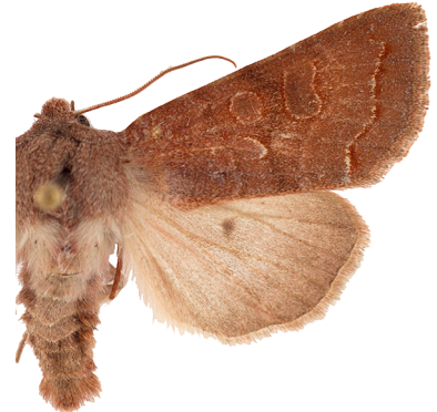
Fig. 16: Orthosia revicta .