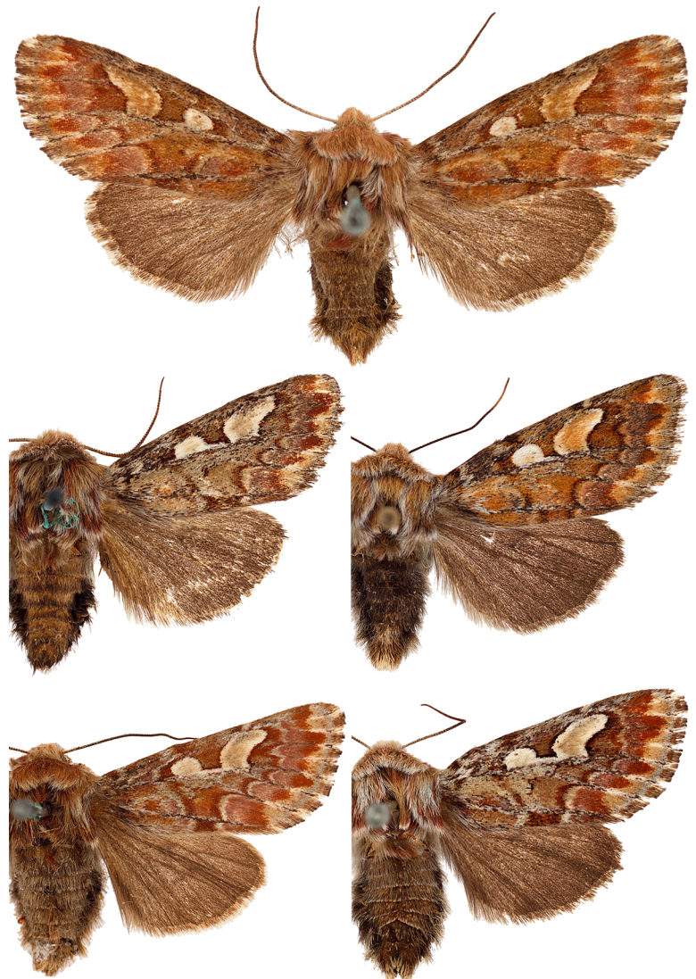
Fig. 4: Variation in wing pattern and coloration of P. flammea adults (top two rows = males; bottom row = females).