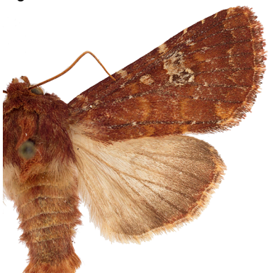
Fig. 17: Sideridis congemana .