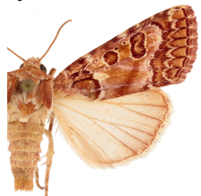
Fig. 19: Hexorthodes hueco .