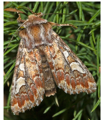
Fig. 2: Panolis flammea resting.