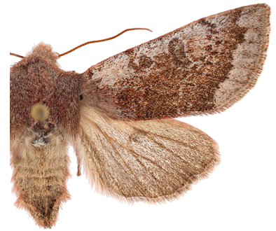
Fig. 10: Orthosia pulchella .