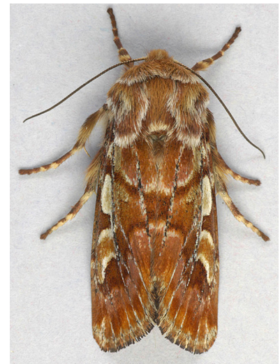
Fig. 1: Panolis flammea resting (Photo by Malcolm Storey, Discover Life).

This aid is designed to assist in the sorting and screening P. flammea suspect adults collected from CAPS bucket traps in the continental United States. It covers basic sorting of traps and first level screening, all based on morphological characters. Basic knowledge of Lepidoptera morphology is necessary to screen for P. flammea suspects.