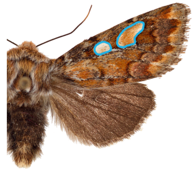
Fig. 5: Typical forewing markings (outlined in blue) for P. flammea (spread specimen).

A sampling of North American non-targets is displayed on Page 4. Non-targets expected to be encountered in P. flammea pheromone traps include other Hadenini as well as Orthosia (Orthosiini). Note that the species on Page 4 have not been verified to be attracted to P. flammea traps and that non-targets encountered during CAPS surveys will vary by region.