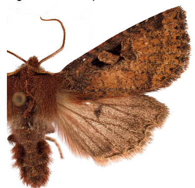
Fig. 13: Orthosia praeses .