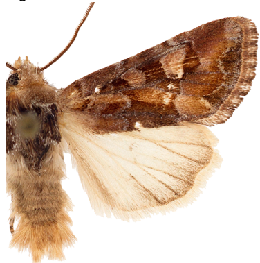
Fig. 18: Lacinipolia lepidula .