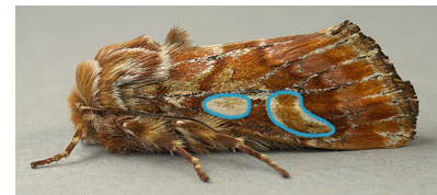
Fig. 6: Typical forewing markings (outlined in blue) for P. flammea (resting specimen - lateral view) (Photo by Malcolm Storey, Discover Life).