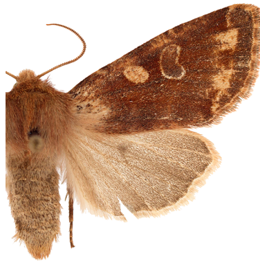
Fig. 9: Orthosia rubescens .