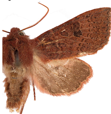
Fig. 12: Orthosia transparens .