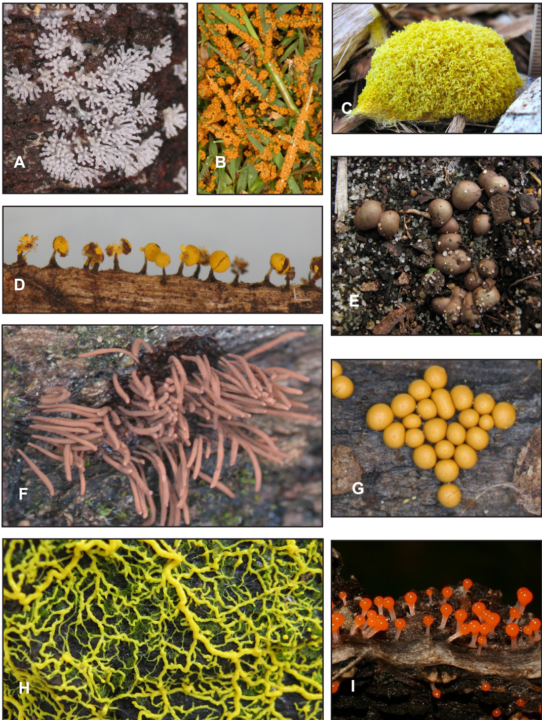
Figure 1. All figures are sporangia unless otherwise mentioned. A – Ceratiomyxa fruticulosa ; B – Badhamia foliicola ; C – Fuligo septica , immature; D – Physarum viride ; E – Lycogala epidendrum ; F – Stemonitis smithii ; G – Trichia persimilis ; H – Plasmodium, indeterminate; I – Trichia decipiens , immature.