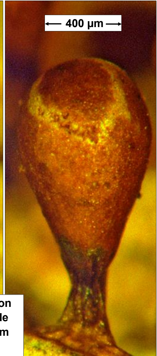
Fruiting bodies in-situ on the wood substrate, side views. Note the peridium areolate dehiscence.