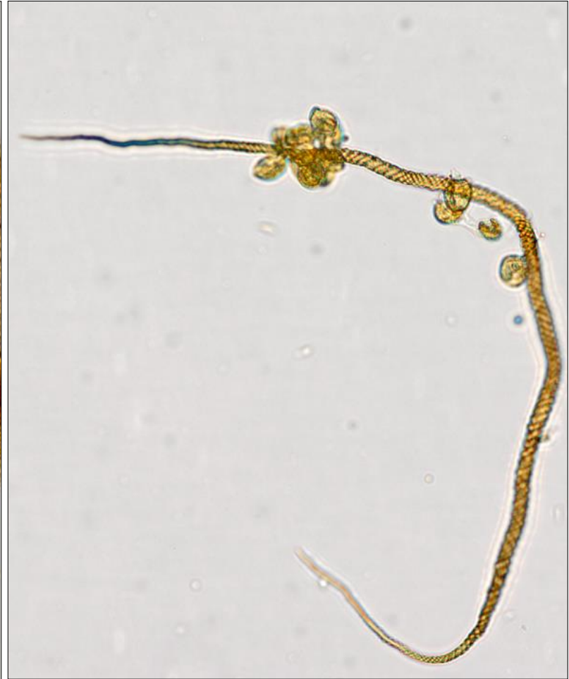
Left photo: Peridium layers - inner lighter, outer darker, SMF-heated. Photographed under X20 objective. Right photo: Spirally banded elater, SMF-heated. Photographed under X40 objective.