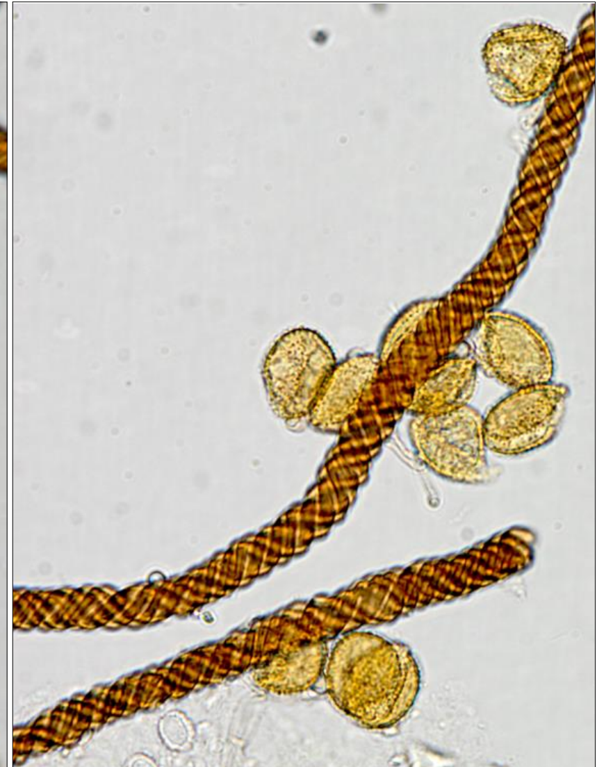
Both photos: Spirally banded elaters & spores, water mount. Focus on the finely warted spore surfaces. Brightfield microscopy, 100X objective. Note that the normally globose spores have collapsed.