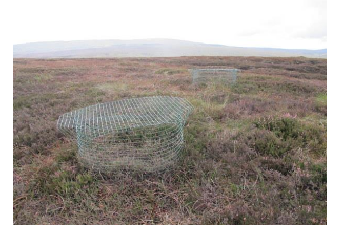
Caged plants of Betula nana protected from over-grazing at Widdybank Fell, Teesdale, the most southerly location for this species in the British Isles.

Small saplings of other birch species may be of similar height but they lack the small, rounded leaves of B. nana and usually have a clear leading shoot. Of several ericaceous sub-shrubs in