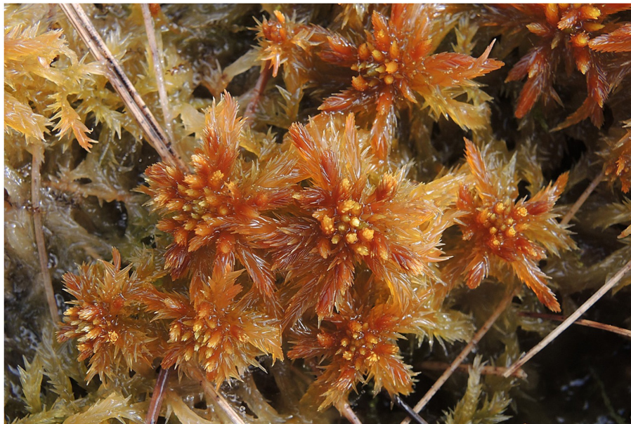
Figure 5. Sphagnum annulatum in Tuulijoki mires, Kittilä.

We had lunch close to a meso-eutrophic spring in Lehmäkallionvuoma. The species we found in the spring and its creek were Pohlia wahlenbergii , Bryum weigelii , Warnstorfia exannulata and Philonotis seriata . We also found patches of Sphagnum teres near the spring.