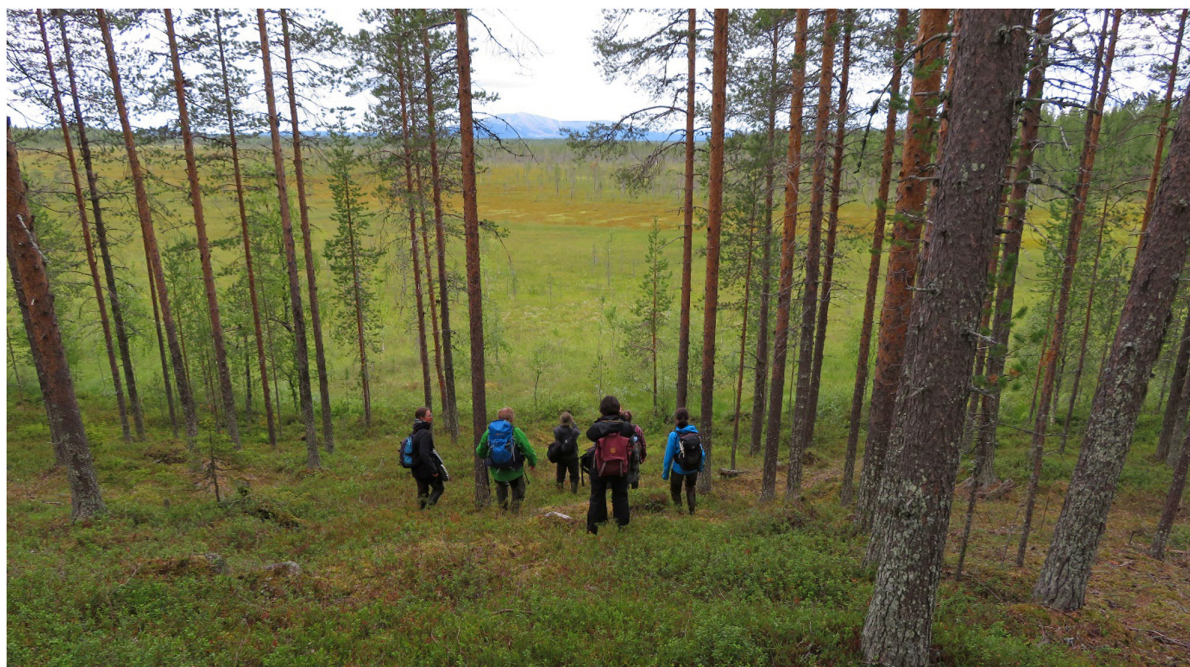
Figure 4. Tuulijoki mires, Kittilä.

Tuulijoki is a mostly oligo-mesotrophic mire area that is in the process of being established as a nature conservation area (Fig. 4). A northwest-southeast ridge runs across the mire, and locals use it as a recreational area. We started from the southern part of the mire (Lehmäkälönvuoma mire; lehmä = cow, kälö = spring, vuoma = mire), which was mostly oligotrophic with several abundantly flowing meso-eutrophic springs. For people of the south, the combination of Sphagna there seemed unusual, for instance, Sphagnum majus var. norvegicum , S. annulatum , S. balticum , S. angustifolium and S. fuscum were growing intermixed.