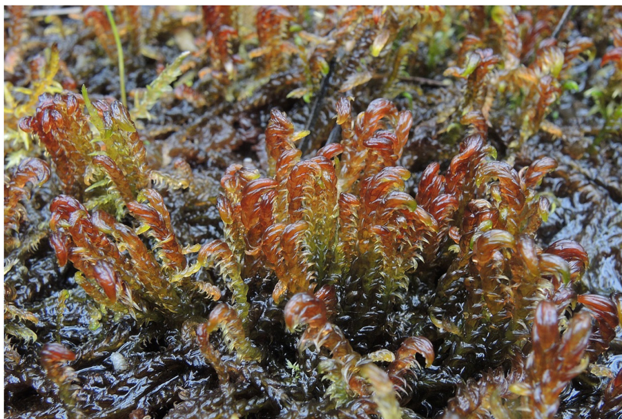
Figure 3. Hamatocaulis lapponicus in Viiankiaapa, Sodankylä.