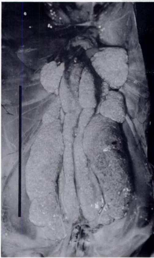
FIGURE 1. Renal coccidiosis ( Eimeria truncata ) in a greylag ( Anser anser anser ) gosling. The kidneys are greatly enlarged and pale. The bird is emaciated. Bar = 10 cm.