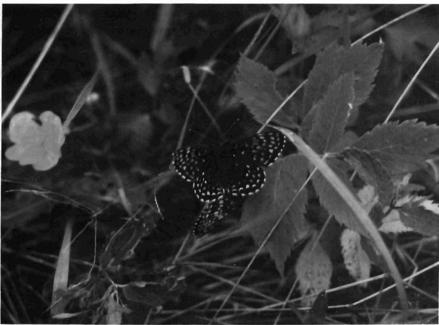
Fig. 1. A mating pair of Melitaea diamina .