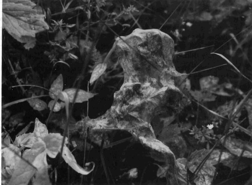
Fig. 4. A Valeriana sambucifolia plant that has been fed on by a group of 2nd instar M. diamina larvae. The silk spun by the larvae is fairly inconspicuous, but the upper epidermis left uneaten by the larvae becomes conspicuous when it dries.