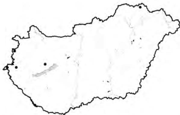
Fig. 4. Records of Pohlia proligera (Breidl.) Lindb. ex Arnell in Hungary (according to herbarium specimens revised by the author).

No specimens labelled P. camptotrachela were seen during the present revision, and the report of this species in ORBÁN and VAJDA (1983) is obviously