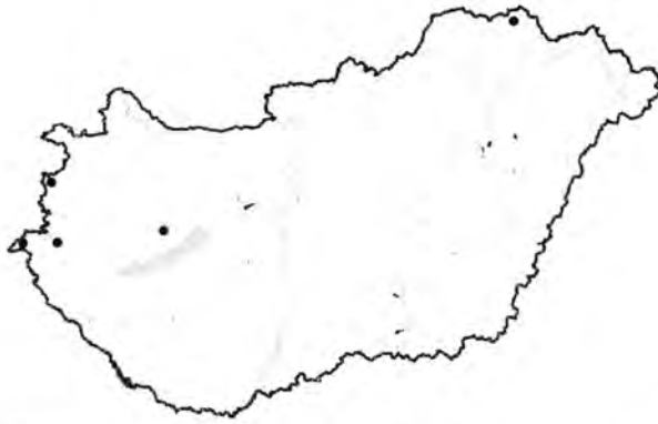
Fig. 2. Records of Pohlia annotina (Hedw.) Lindb. in Hungary (according to herbarium specimens revised by the author).