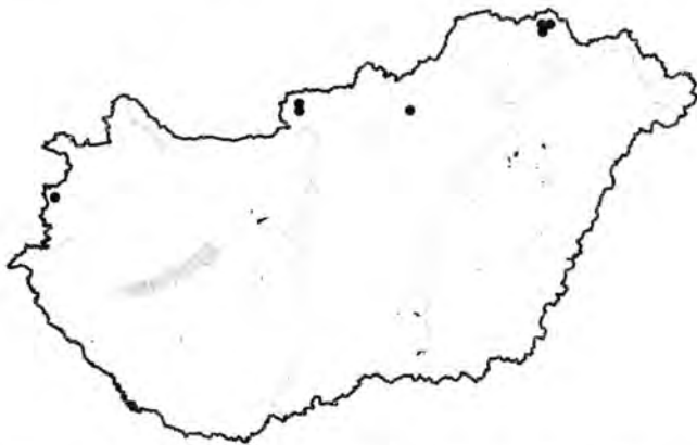
Fig. 1. Records of Pohlia andalusica (Höhn.) Broth. in Hungary (according to herbarium specimens revised by the author).

Kőszeg Mts: Bozsok: Hegyhát (BP 75621, BP 75623: 18.06.1970 leg. L. Vajda, BP 116197, EGR: 11.06.1970 leg. Á. Boros, BP 116199: 13.06.1970 leg. Á. Boros).