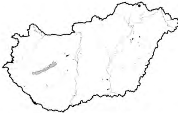
Fig. 3. Records of Pohlia camptotrachela (Renauld et Cardot) Broth. in Hungary (according to herbarium specimens revised by the author).

Zemplén Mts: Telkibánya: Farkas-hegy (BP 116206: 19.10.1959 leg. Á. Boros, mixed with P. andalusica ).