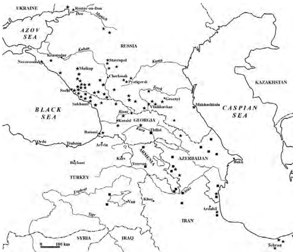
Fig. 5. Map showing the distributions of Strongylosoma kordylamythrum Attems, 1898 (asterisk) and S. lenkoranum Attems, 1898 (square).

Our map (Fig. 5) shows that the distributions of S. kordylamythrum and S. lenkoranum in the Caucasus region differ considerably. Nguyen & Sierwald (2013) listed only “Georgia, Caucasus, Iran” for the former and “Georgia, Caucasus” for the latter. In fact, S. kordylamythrum occurs throughout the northern Caucasus (Krasnodar and Stavropol provinces, Adygea, Karachaevo-Cherkessia, Kabardino-Balkaria, North Ossetia, Ingushetia, Chechenia and Dagestan), reaching