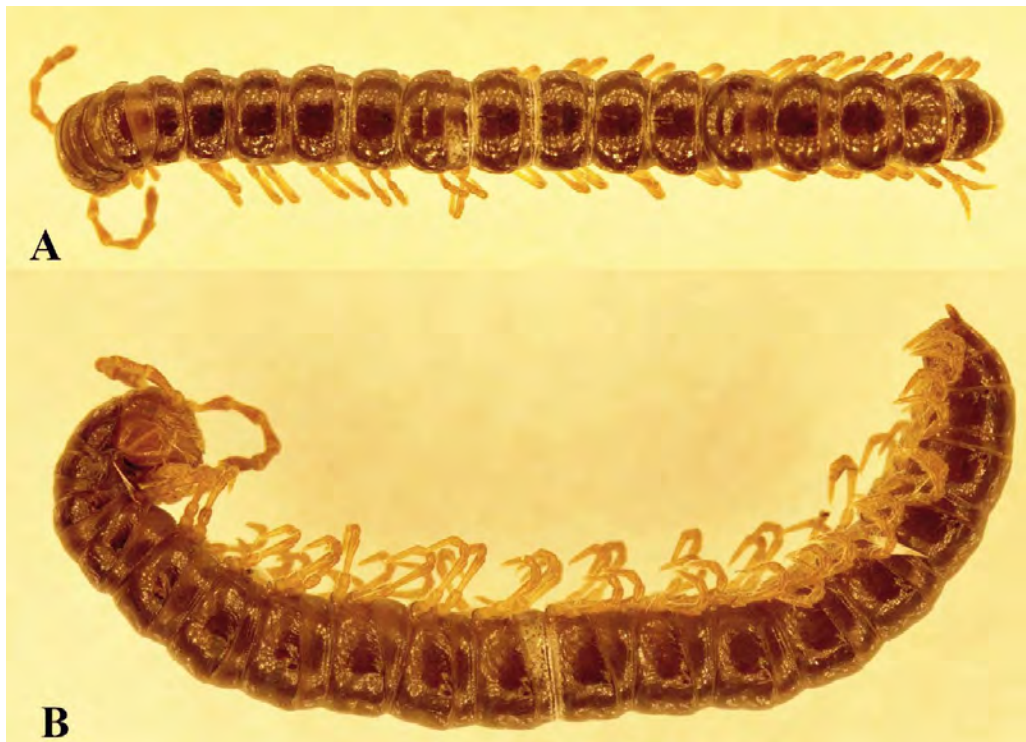
Fig. 1. Strongylosoma kordylamythrum Attems, 1898, female from Adygea, habitus. A – dorsal view, B – lateral view. taken not to scale.