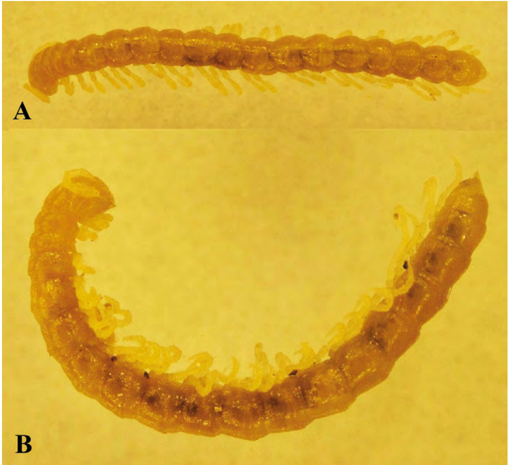
Fig. 3. Strongylosoma lenkoranum Attems, 1898 male from Azerbaijan, habitus. Same as in Fig. 1.