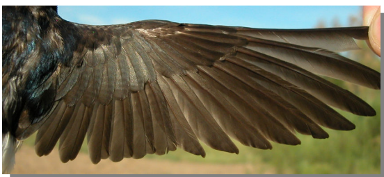
House Martin. Adult. Female with male-like morph: pattern of wing (04-VI).