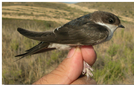
House Martin. Juvenile (21-VIII).