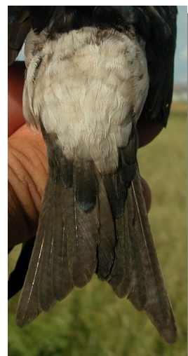
House Martin. Rump pattern: left adult male (30-V); right adult female (04-VI).