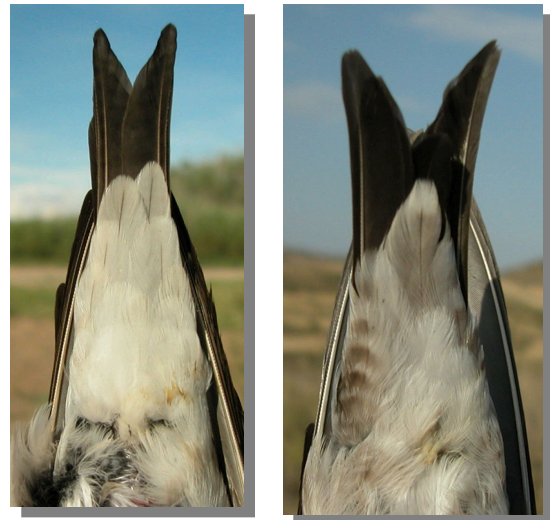
House Martin. Pattern of undertail coverts: left adult female with male-like morph (04-VI); right juvenile (21-VIII).