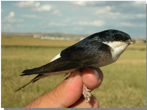
House Martin. Adult. Male (30-V).