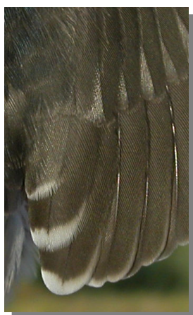
House Martin. Pattern of tertials: left adult (30-V); right juvenile (21-VIII).