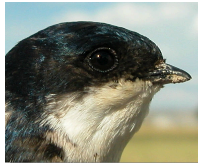
House Martin. Ageing. Pattern of head and bill: top adult; bottom juvenile.