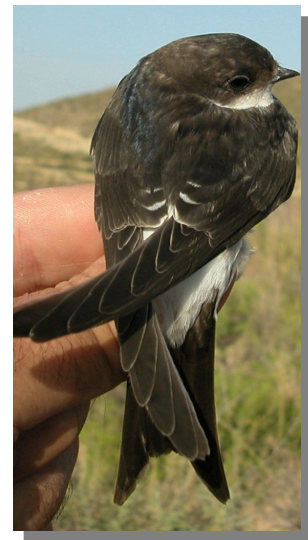
House Martin. Ageing. Pattern of upperparts: left adult; right juvenile.