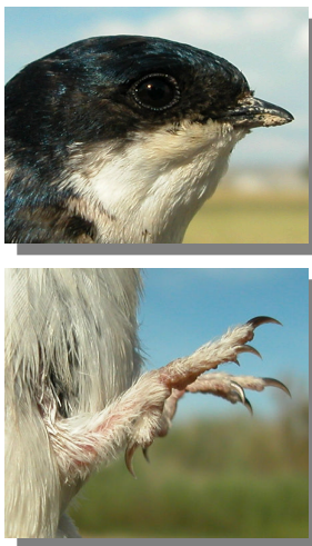
House Martin. Pattern of head, rump and legs.

13-15 cm. Dark blue upperparts; white underparts; white rump; only moderately forked tail.