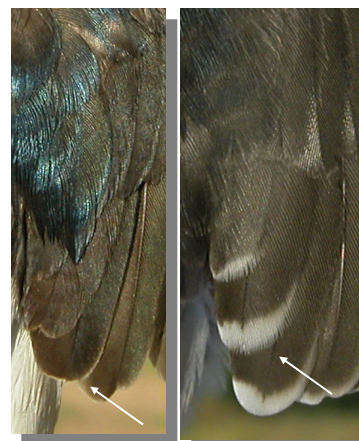
House Martin. Ageing. Pattern of tertials: left adult; right juvenile.

In spring , after postbreeding/postjuvenile moults, ageing is not possible using plumage pattern.