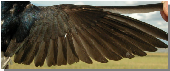
House Martin. Adult. Male: pattern of wing (30-V).