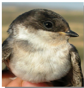
House Martin. Breast pattern: top left adult male (30-V); top right adult female (04-VI); left adult female with male-like morph (04-VI); bottom juvenile (21-VIII).