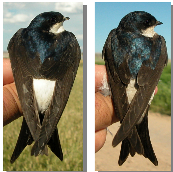
House Martin. Upperpart pattern: left adult male (30-V); right adult female (04-VI).