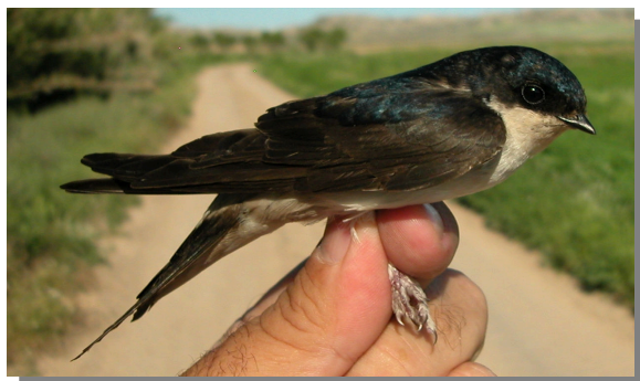
House Martin. Adult. Female (04-VI).

Summer visitor, breeds commonly in buildings and cliff faces in mountainous areas of the Region being absent in the most deforested zones of the Ebro Basin.