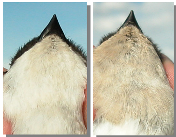
House Martin. Sexing. Pattern of throat: left male; right female.

Sexes with very similar plumage but some differences can be found: males tend to exhibit pure white on throat and rump; undertail coverts white with a narrow dark line on shaft. Females tend to exhibit grey tinge on throat and rump; undertail coverts with grey tinge ( CAUTION: some males with female-like pattern and females with male-like pattern can be found which are inseparable by plumage). Juveniles cannot be sexed.