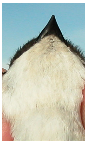
House Martin. Adult. Throat pattern: top left male (30-V); top right female (04-VI); left female with male-like morph (04-VI).