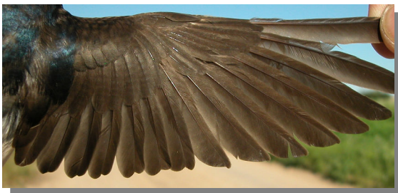
House Martin. Adult. Female: pattern of wing (04-VI).