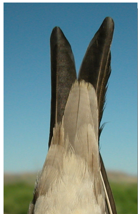
House Martin. Sexing. Pattern of undertail coverts: left male; right female.