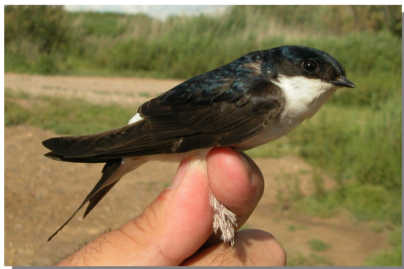
House Martin. Adult. Female with male-like morph (04-VI).