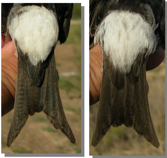
House Martin. Rump pattern: left adult female with male-like morph (04-VI); right juvenile (21-VIII).