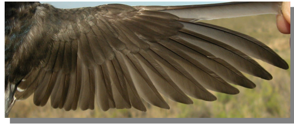
House Martin. Juvenile: pattern of wing (21-VIII).