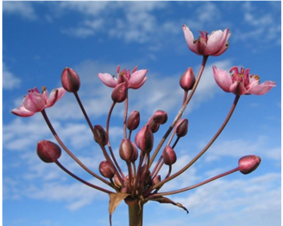
ABOVE: Flowering rush flower close-up LEFT: Flowering rush plant

Flowering rush is a cattail-like perennial of freshwater wetlands. It is native to Africa, Asia and Europe 1 and was likely introduced to North America as an ornamental plant. It is the only member of the Butomaceae family and is able to reproduce both by seed and vegetatively (rhizomatous roots form bulblets which separate from the parent plant 3 ). Flowering rush infestations can displace native vegetation and result in reduced water quality which may disrupt valuable fish and wildlife habitat. Dense stands in irrigation ditches can reduce water availability, and in lakes can interfere with boat propellers and swimming. 3 Plants flower summer to fall. 1 Flowers are hermaphroditic (contain both male and female organs) and are pollinated by bees, flies and butterflies. 2