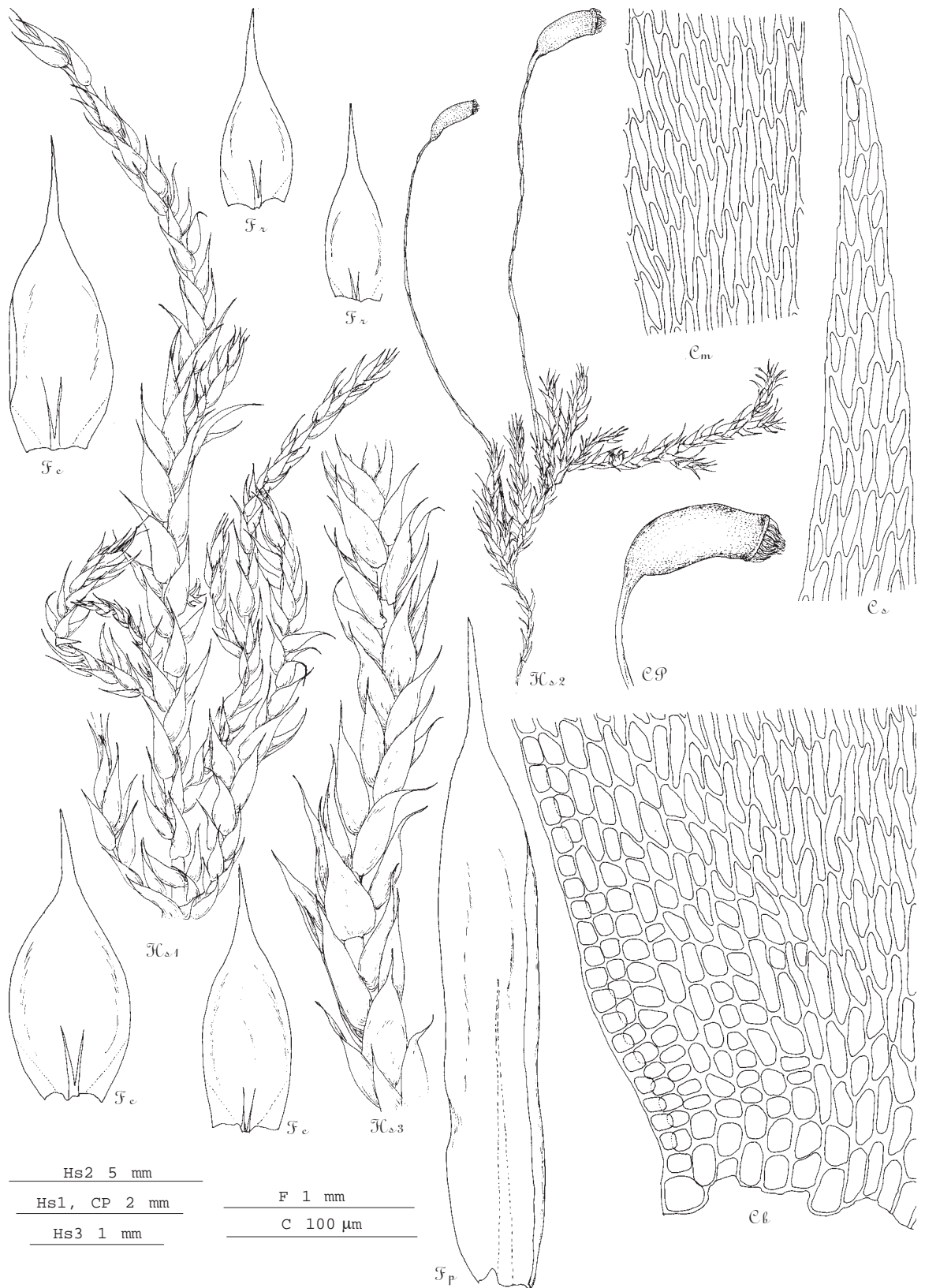
Homallium plagiangium (Müll. Hal.) Broth.